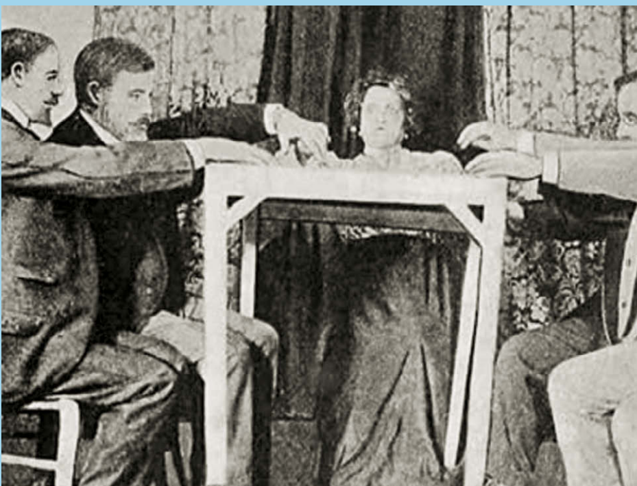
Eusapia Palladino levitates a table in the presence of four researchers

Experiments that Dr Eugene Osty conducted in 1930 in Paris with the Polish medium Rudi Schneider suggest that an invisible psychic force was able to break infrared beams projected within the séance room, thereby setting off an alarm. Those documented instances of the use of infrared technology demonstrate that it will not inhibit genuine phenomena. And it is unlikely that invisible infrared rays will prove dangerous to genuine physical mediums.