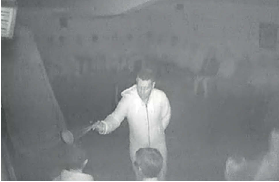
A still from the video of the fake séance which can be viewed in its entirety at garyfiles.co.uk

report was “not fair journalism – it’s setting out to destroy me”. He added: “Why would I let you ask my team questions for you to twist what they say? I will pass the articles on to my lawyer and seek advice.”