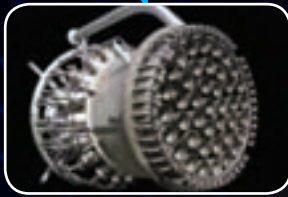
Replacement Flare Tips