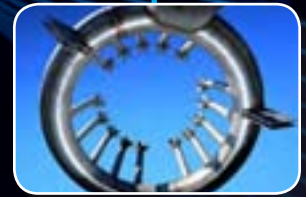
Upper Steam Ring