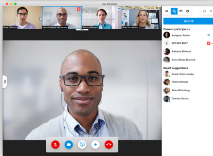
Meet face to face with your co-workers or customers in HD video.