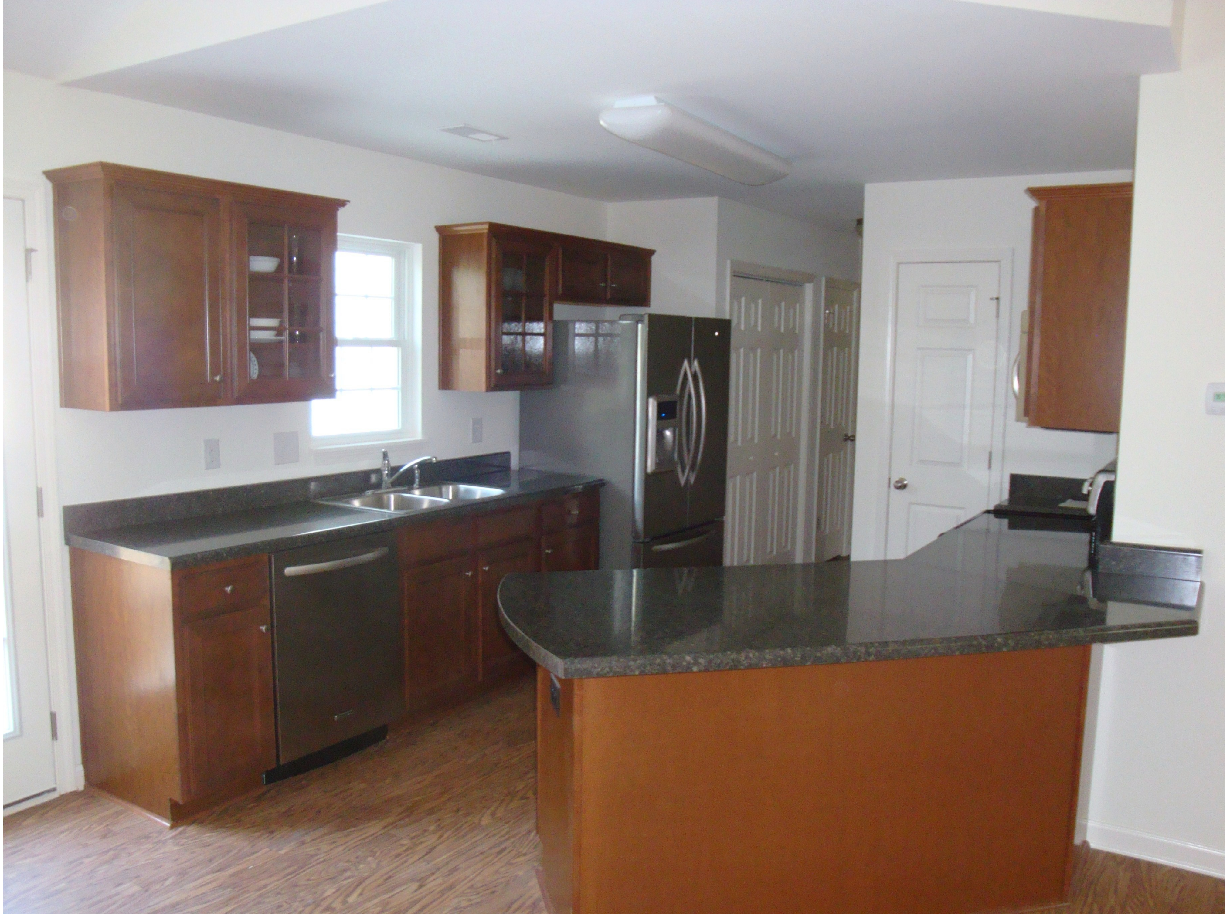
Open Kitchen with Breakfast Bar