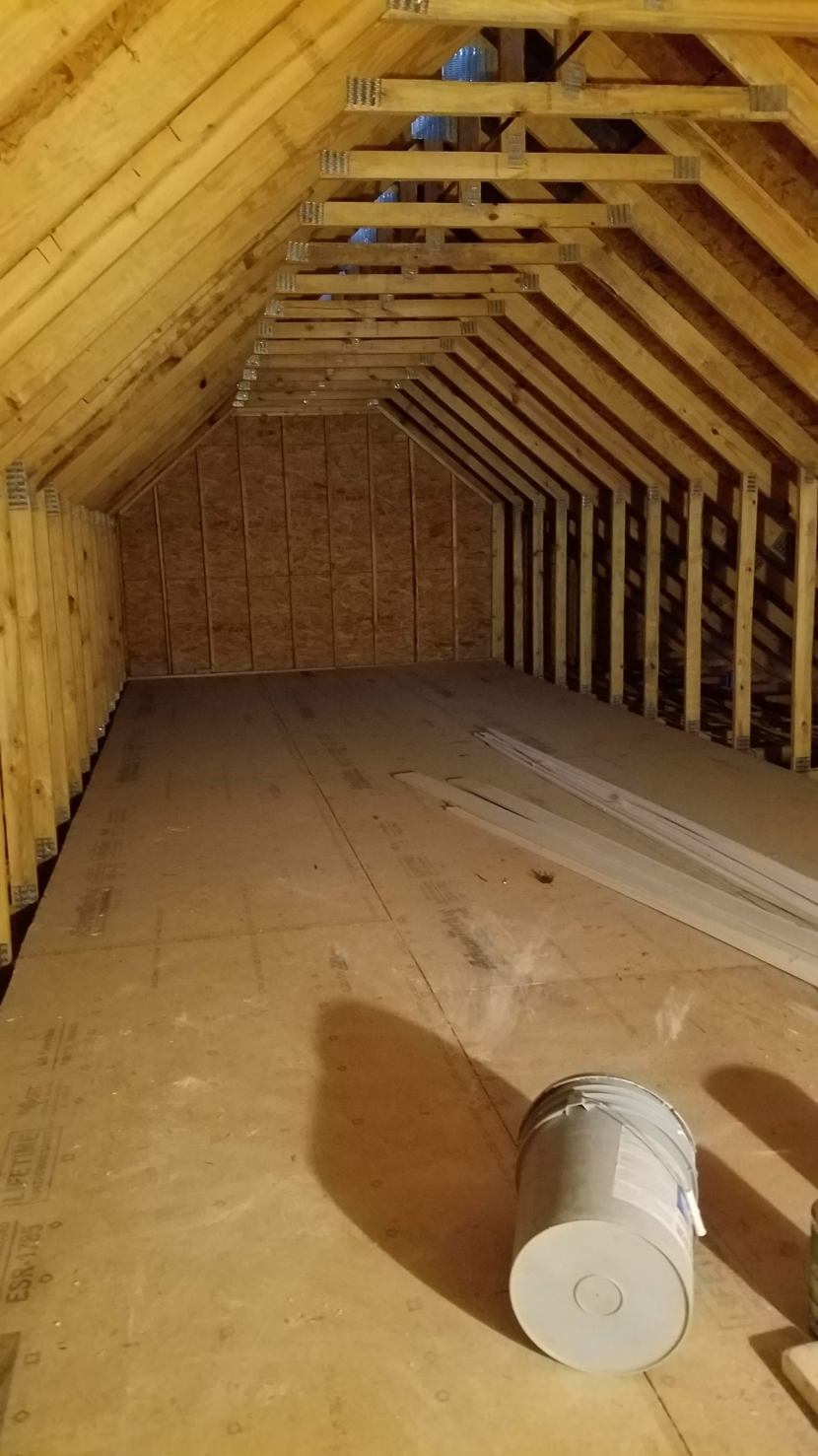
Attic Truss Option over Garage