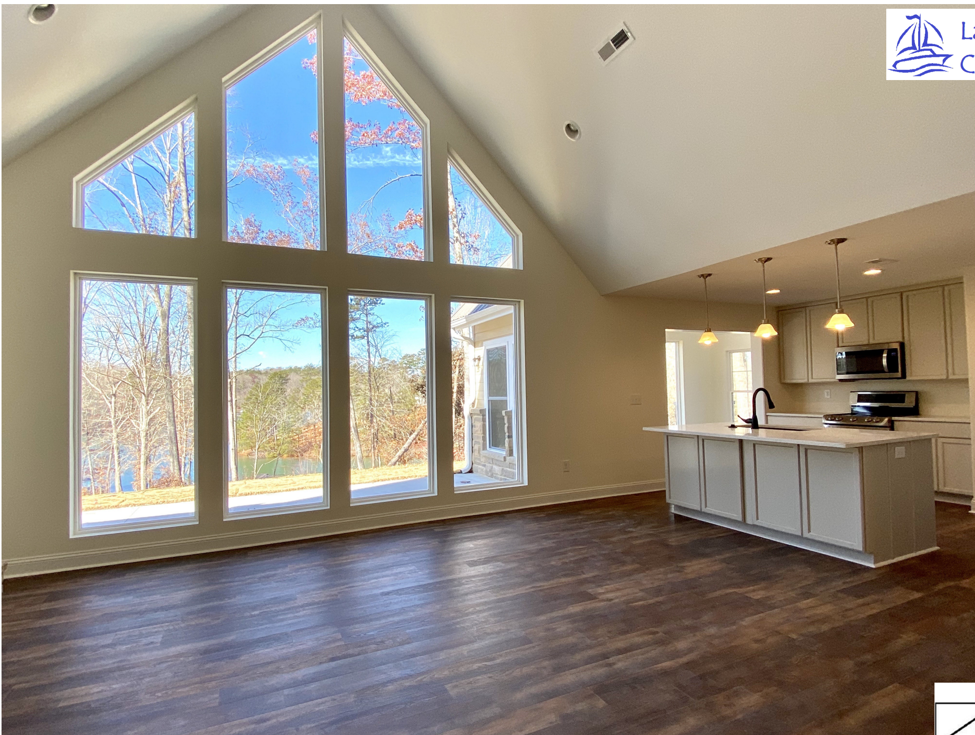
Open Living/Kitchen with dramatic 2 story wall of windows