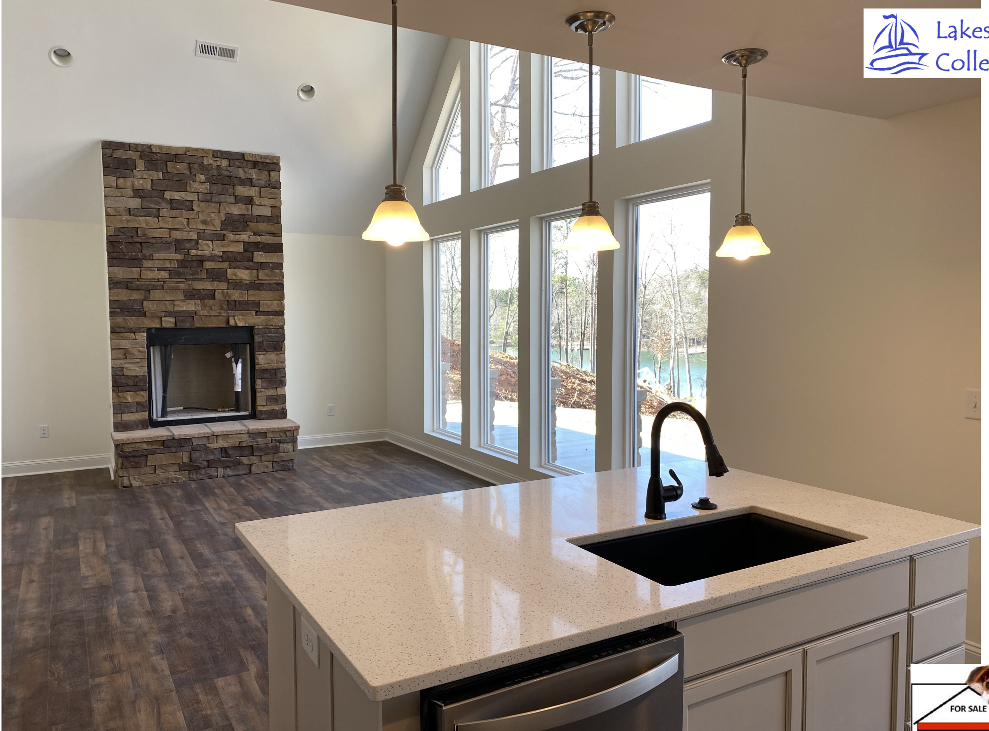
Open Living/Kitchen with dramatic 2 story wall of windows