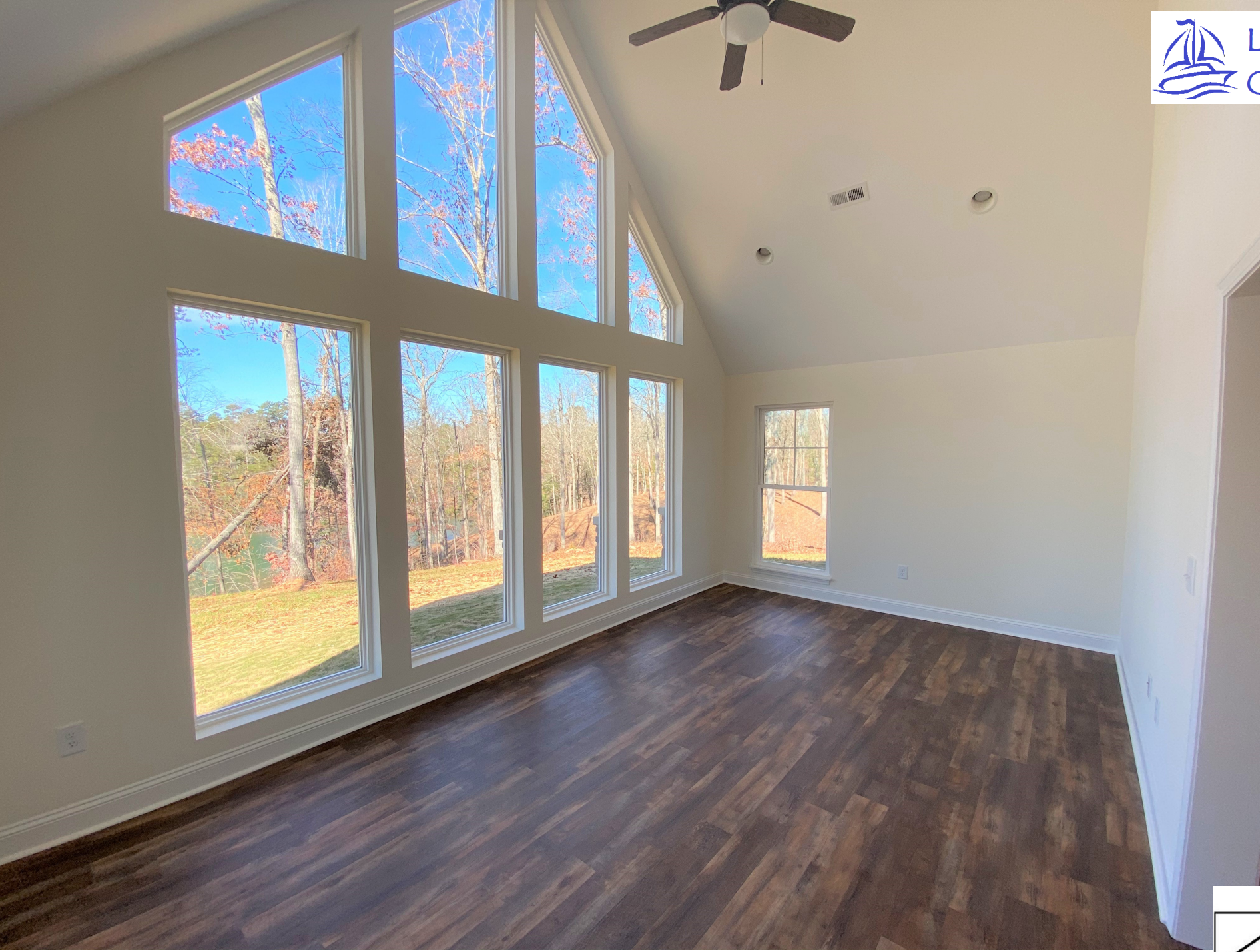
Sunroom off of Kitchen with dramatic 2 story wall of windows