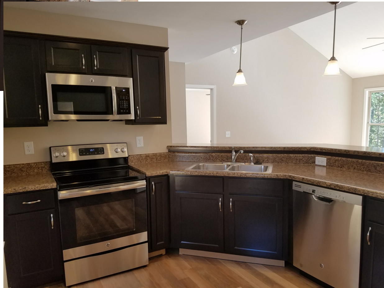
Kitchen with breakfast bar