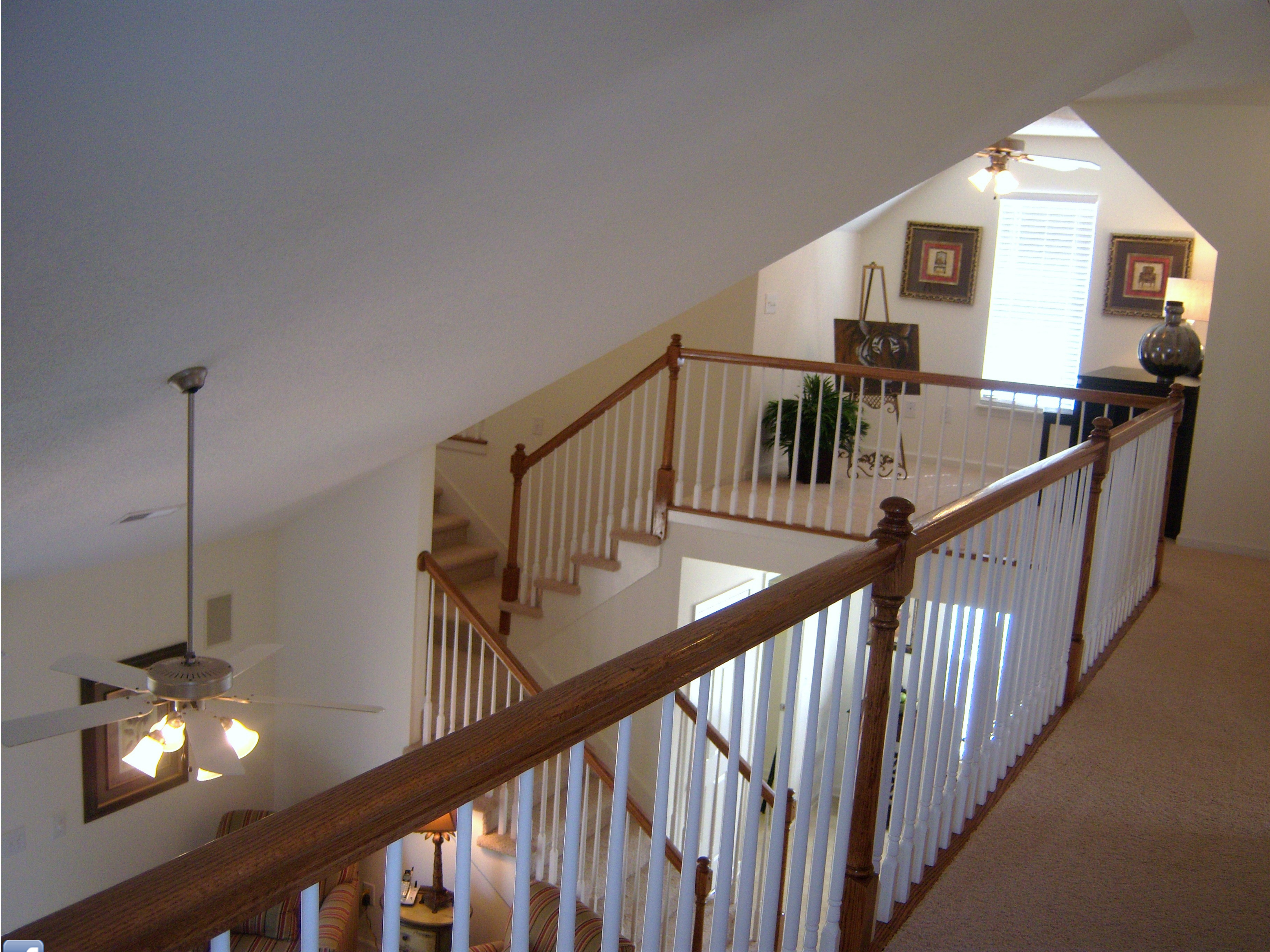
Balcony overlooking Great Room