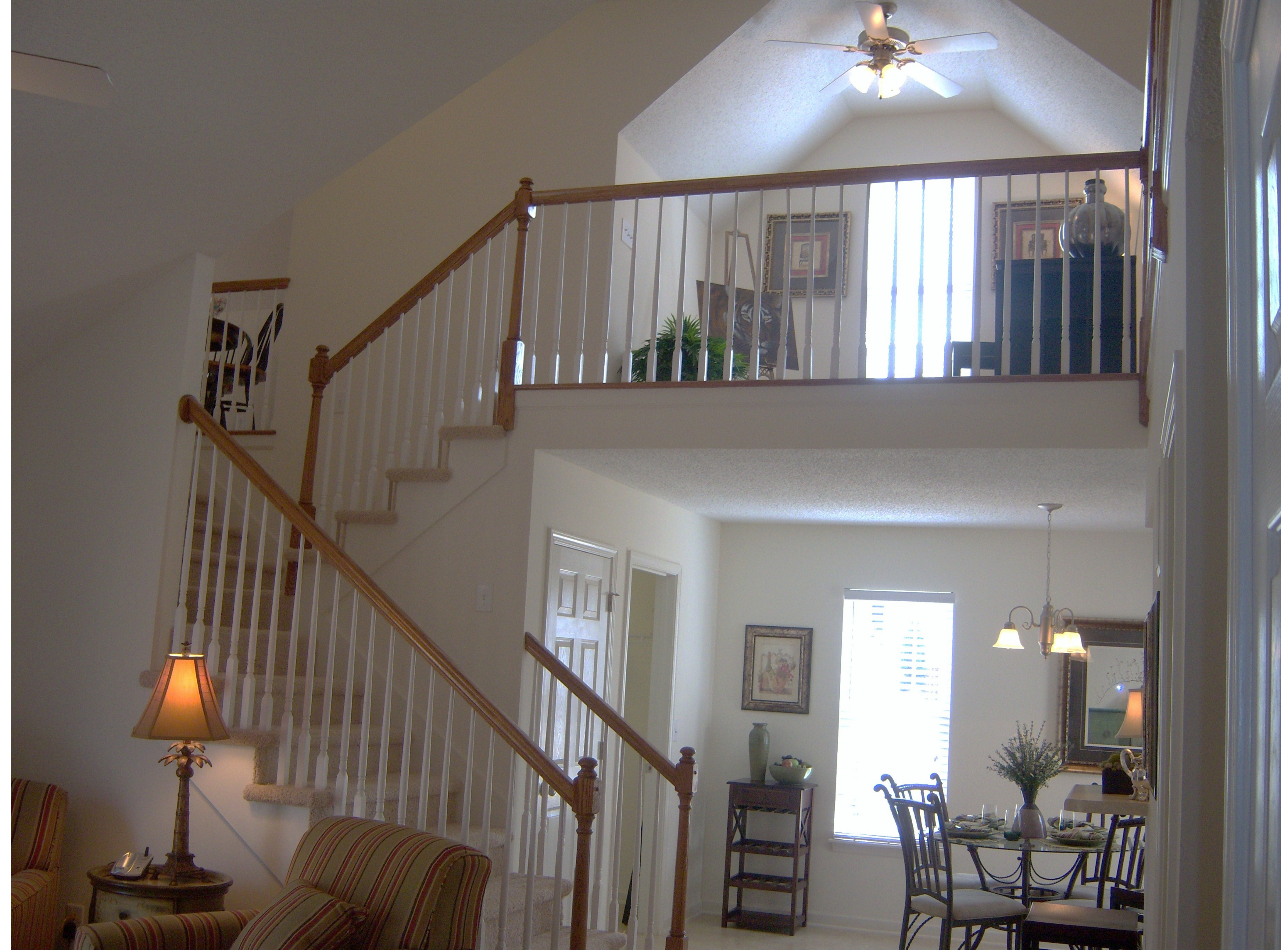
Vaulted Living Room