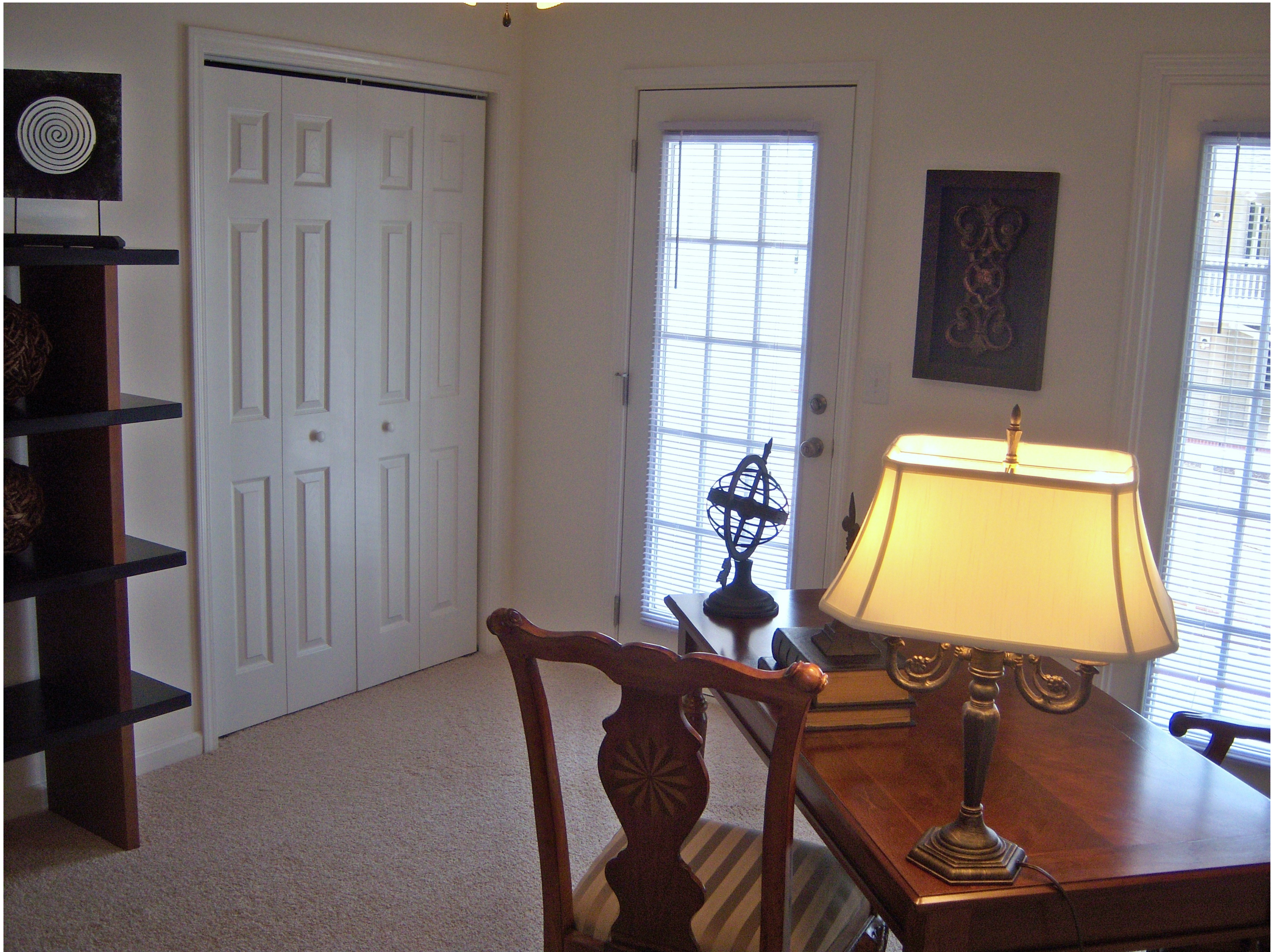
Bedroom #3 or Office