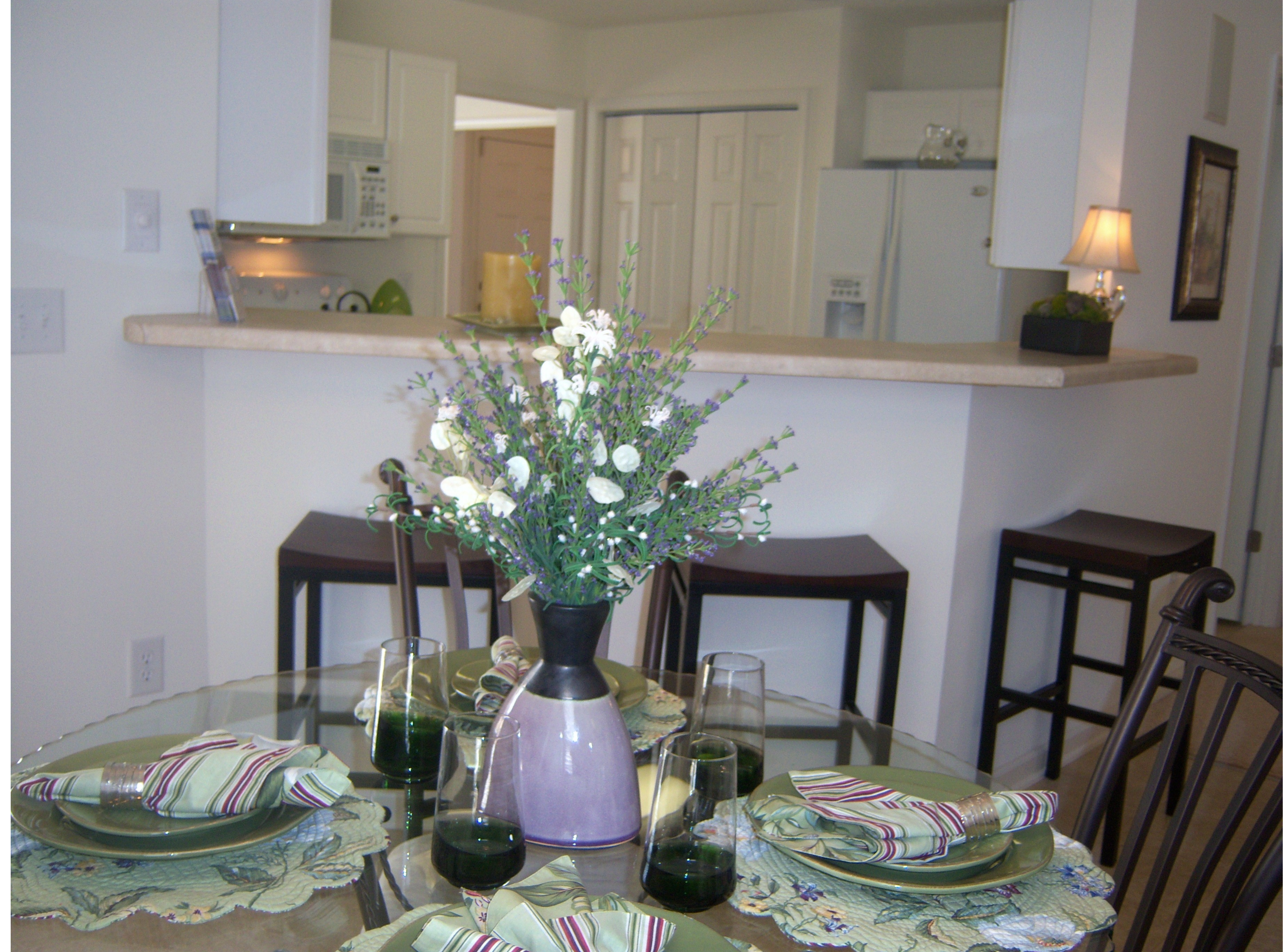
Breakfast Room open to Kitchen Bar