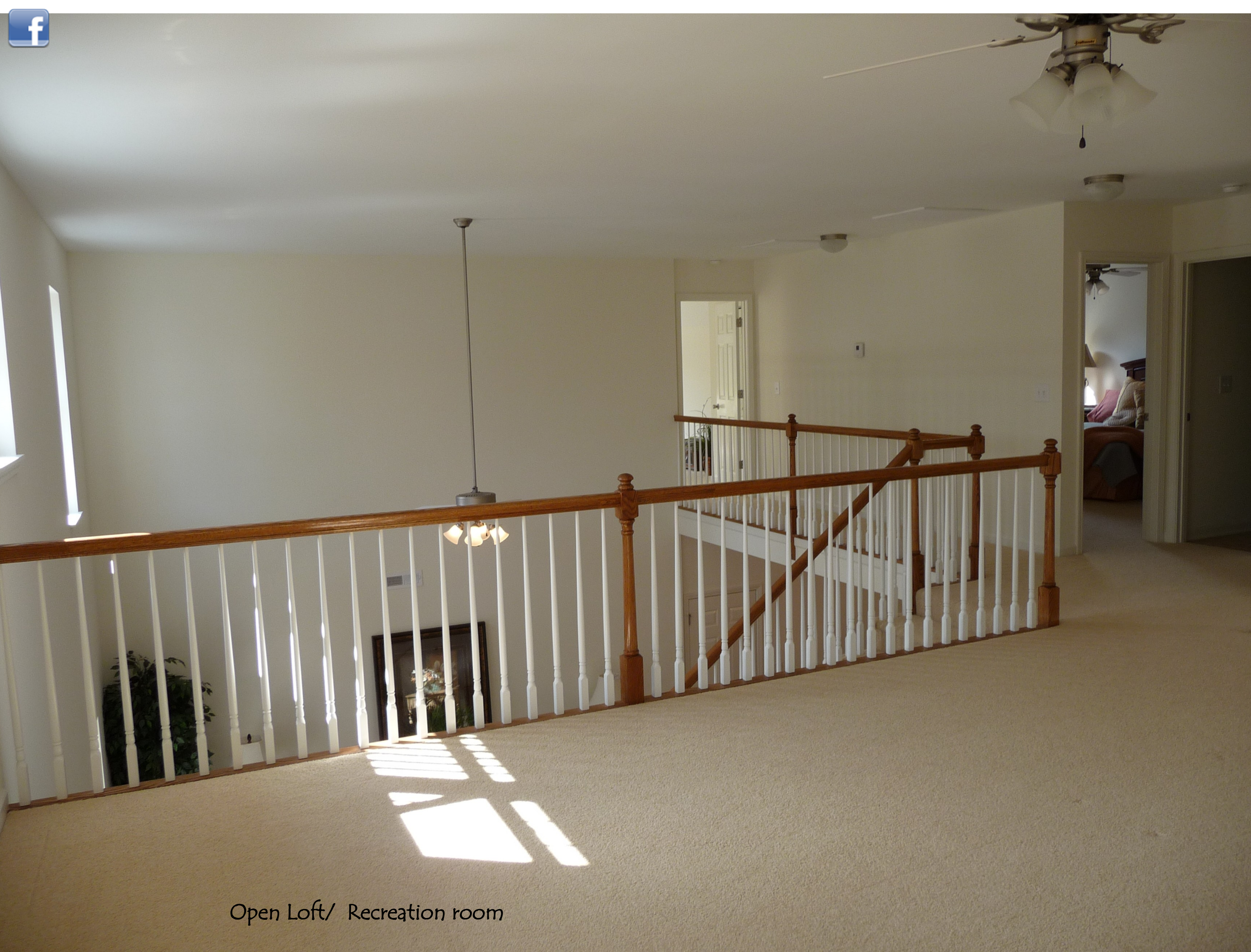
Open Loft/ Recreation room