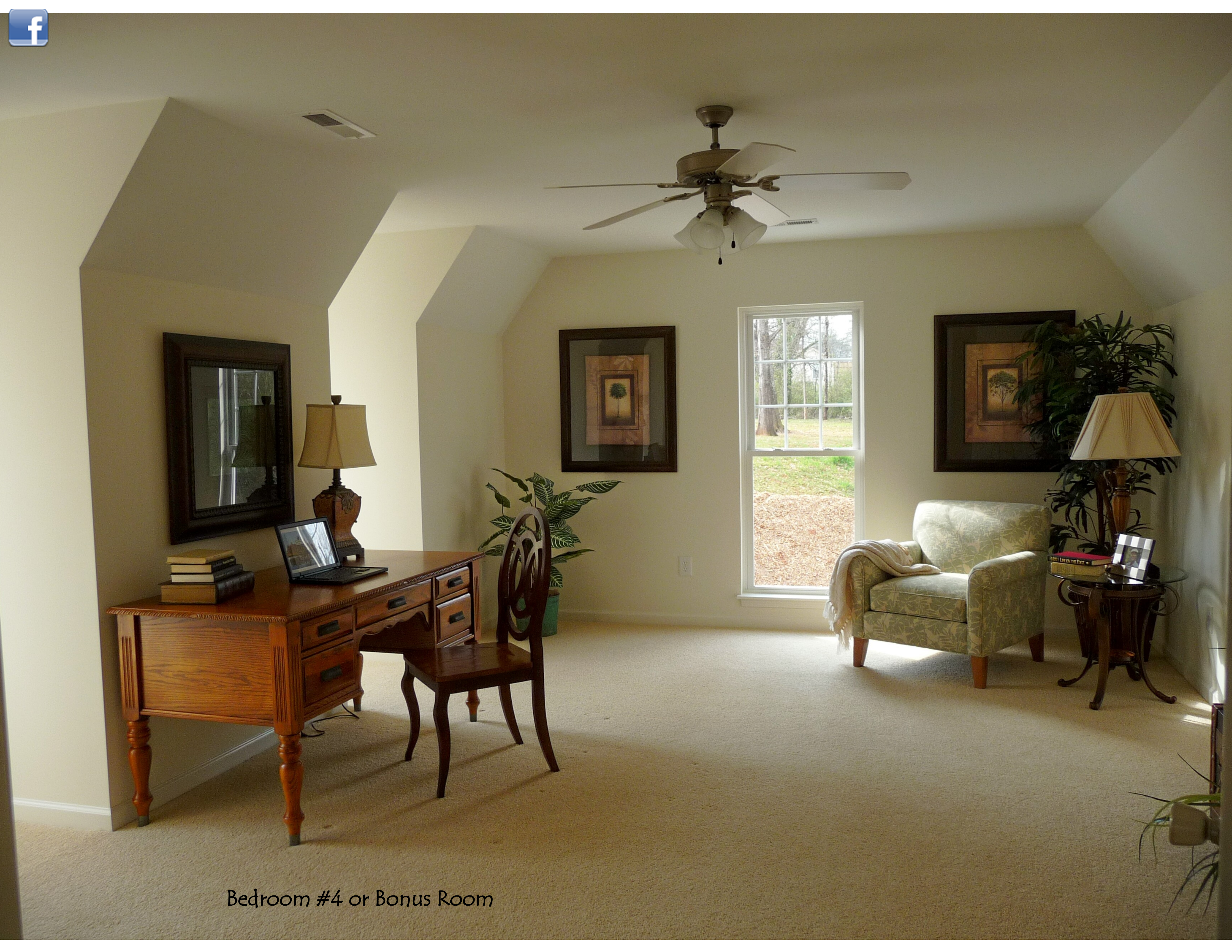
Bedroom #4 or Bonus Room