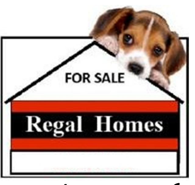
"Live The Great Life"