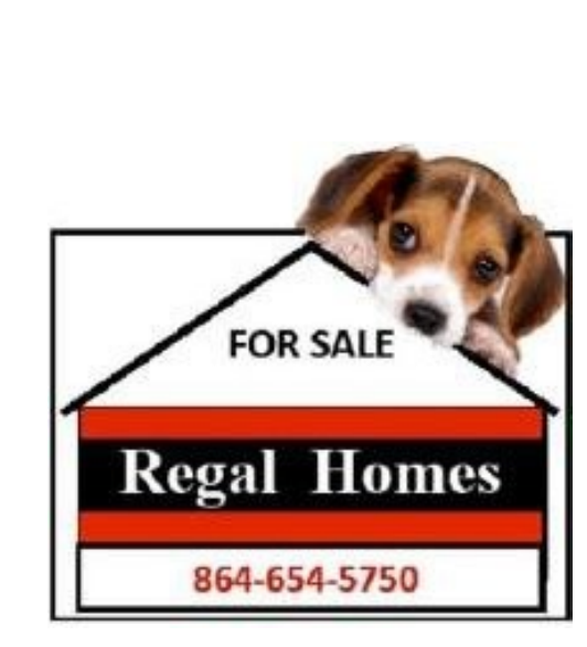
"Live The Great Life"