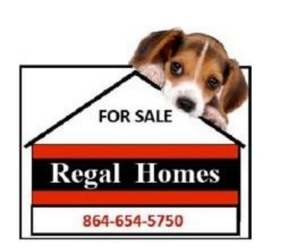
"Live The Great Life"

Ceramic Tile Shower with 3 shower heads in Master