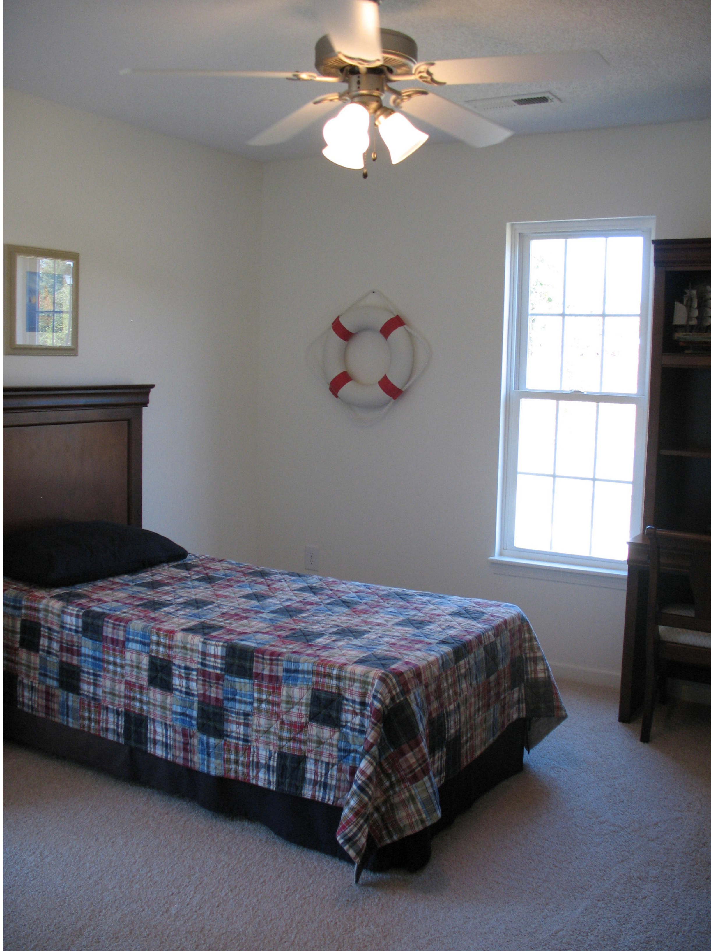
Bedroom # 2