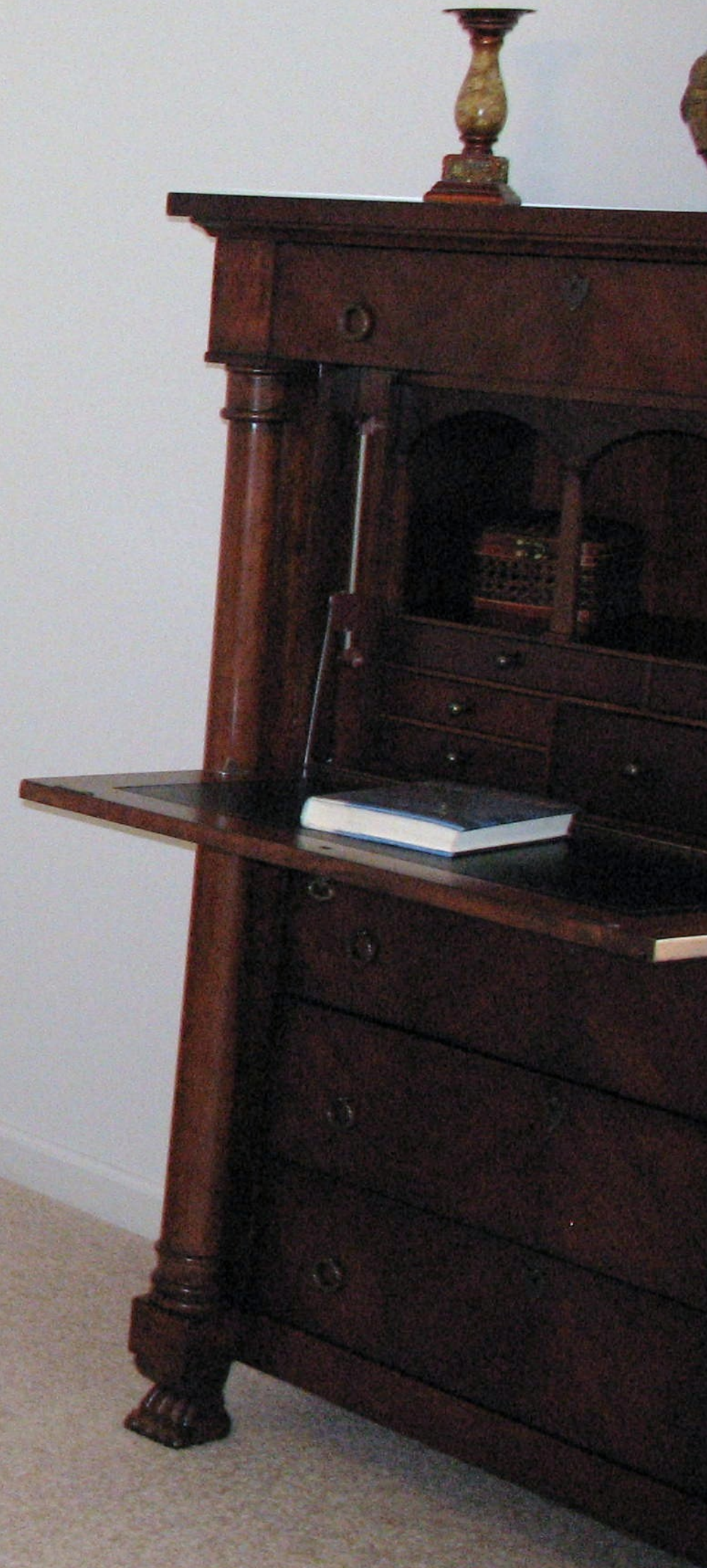
Bedroom # 3