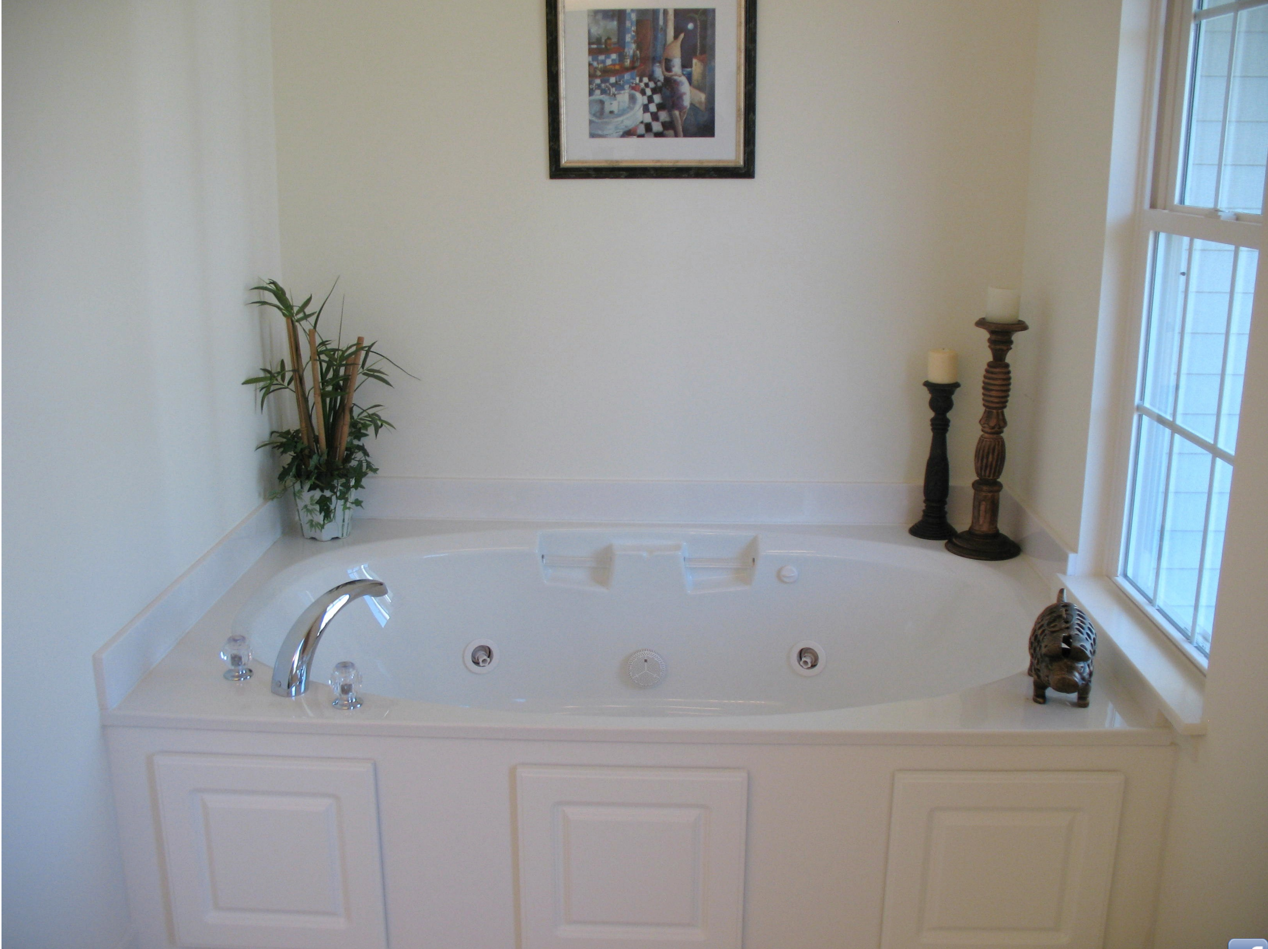
2 Person Whirlpool Tub in Master Bathroom