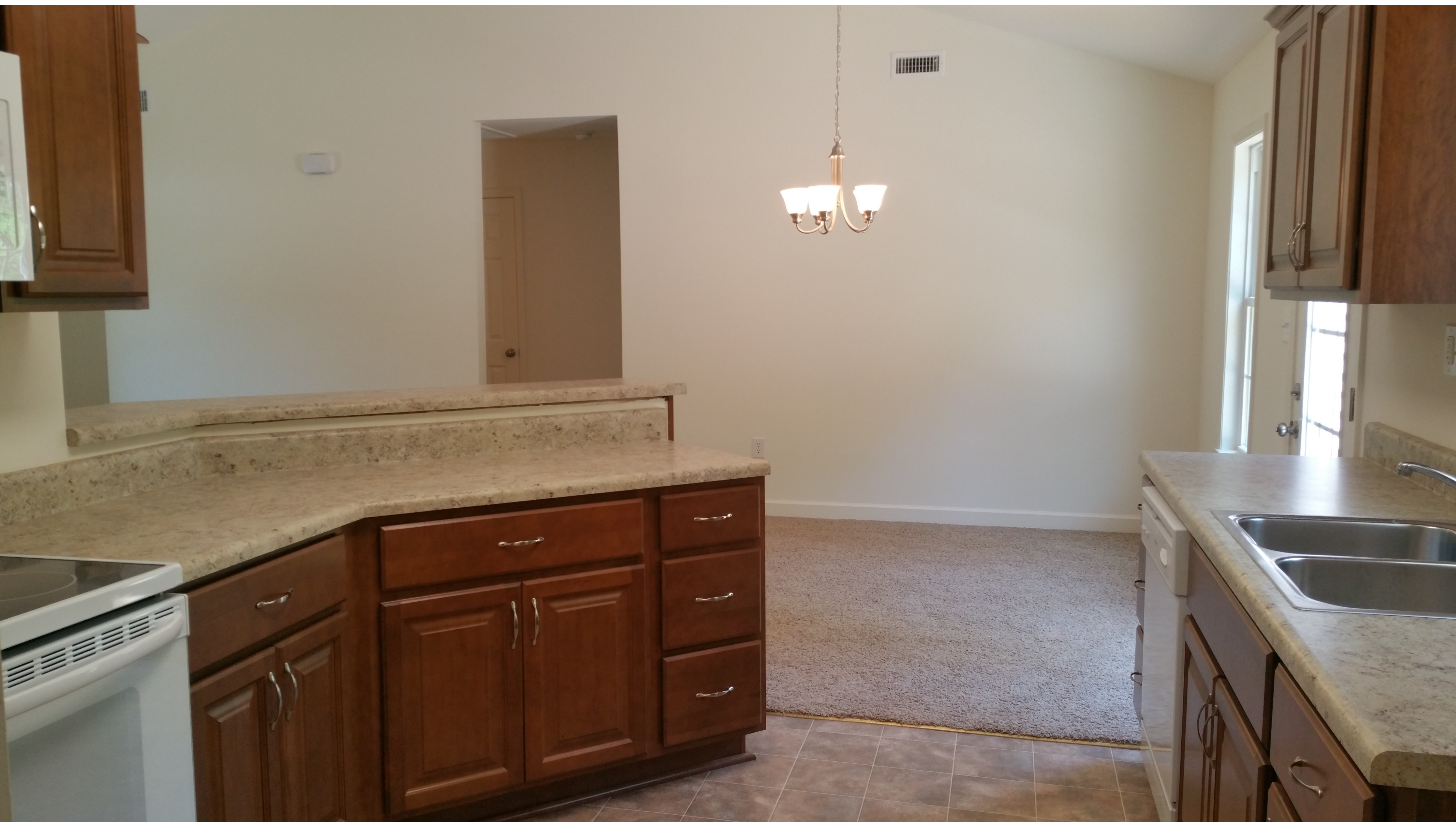
Kitchen with Breakfast Bar