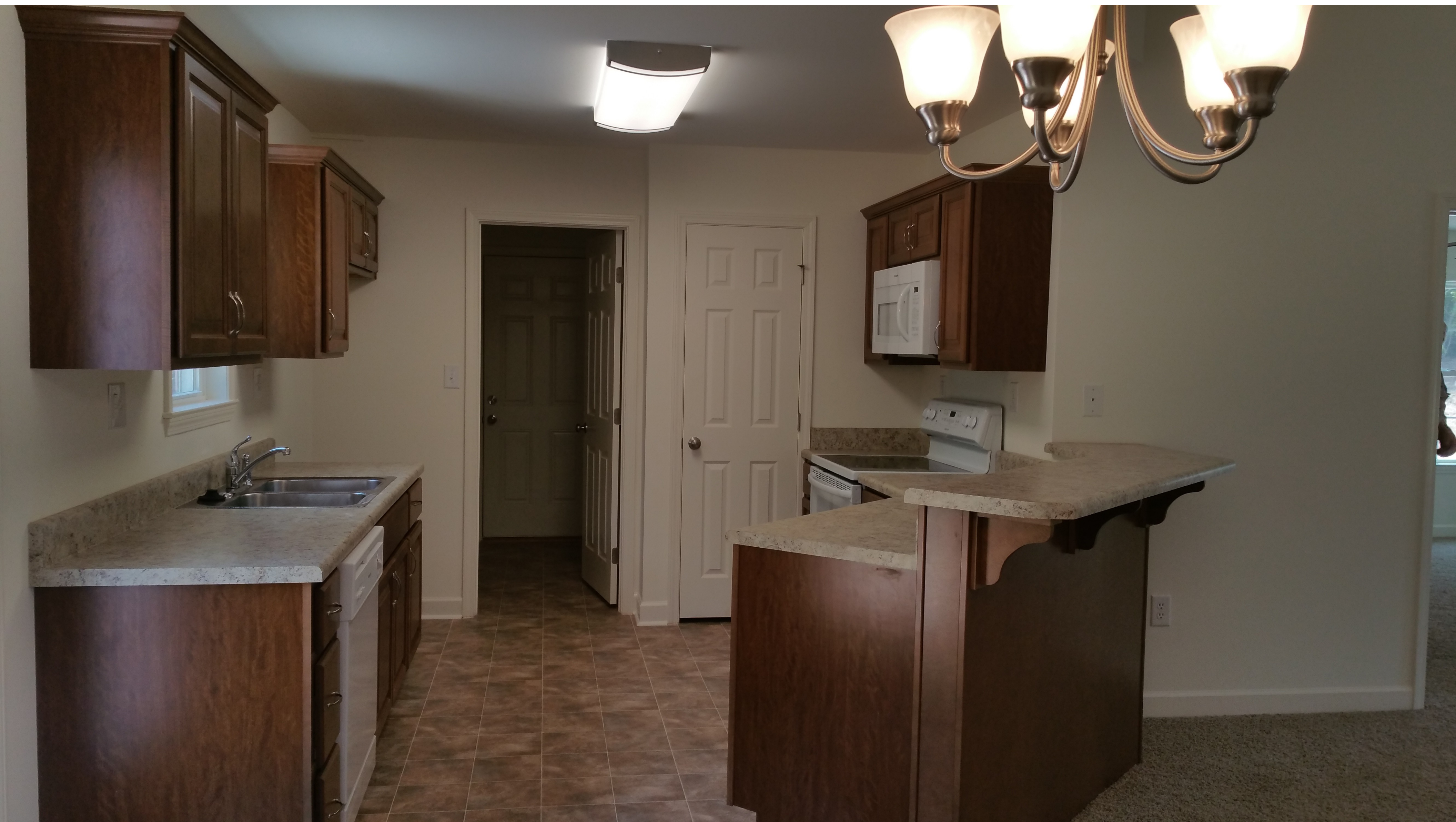
Kitchen with Breakfast Bar