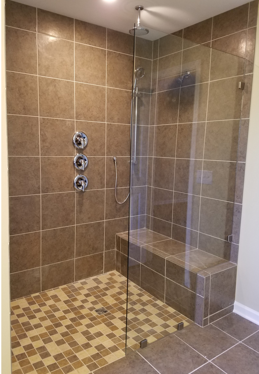
Optional: 4ft X6ft ceramic tile shower w/3 shower heads