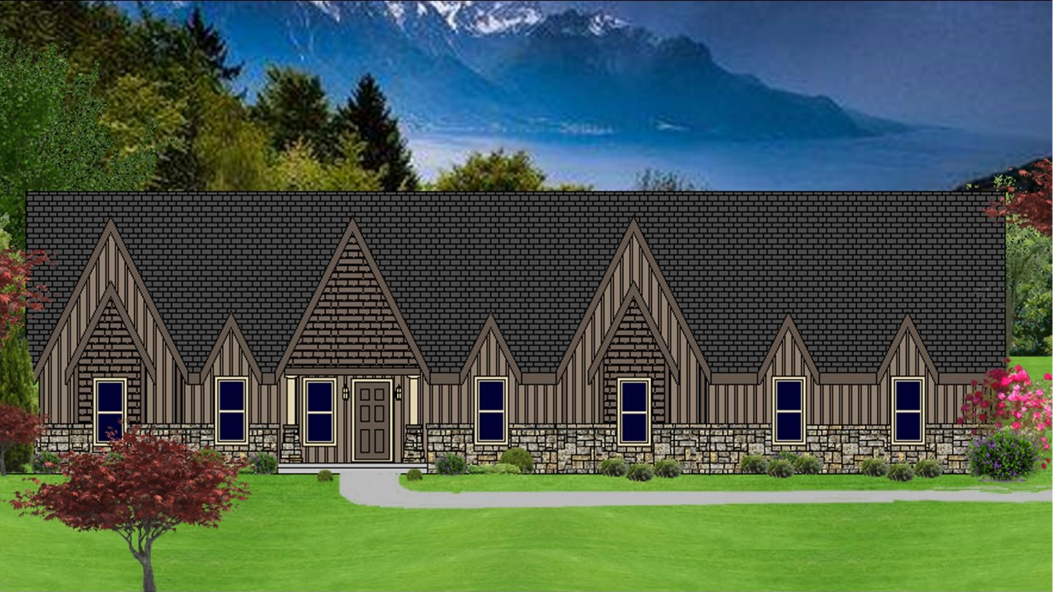
The Springfield IX with Side Garage–Alpine Street Side Elevation