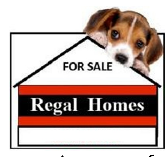
"Live The Great Life"