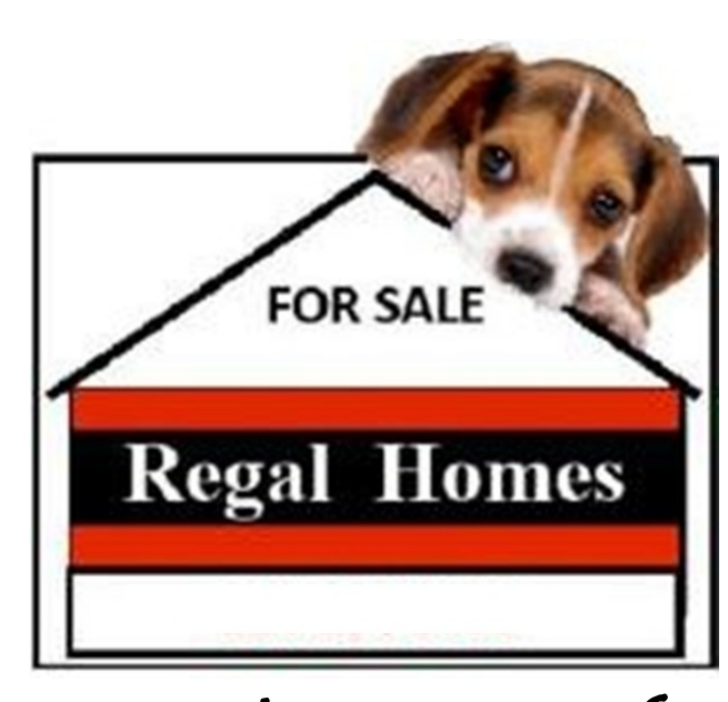
"Live The Great Life"