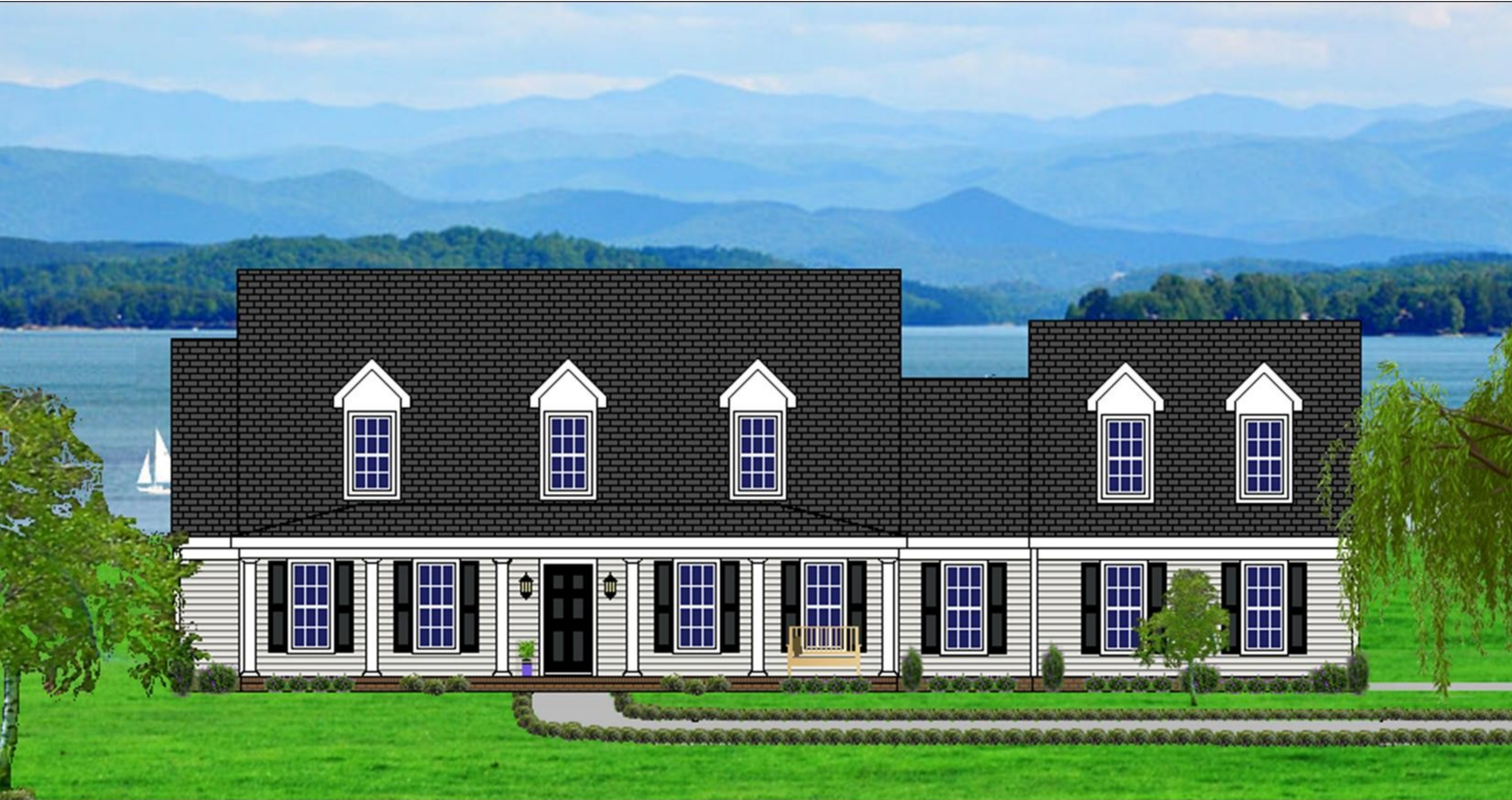
The Summerville-Lake XXV with Side Garage Street Side Elevation