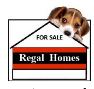
"Live the Great Life"