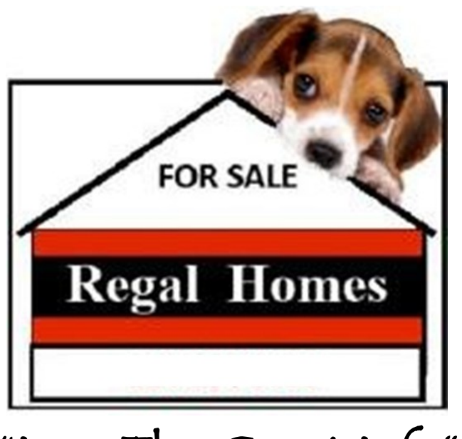
"Live The Great Life"