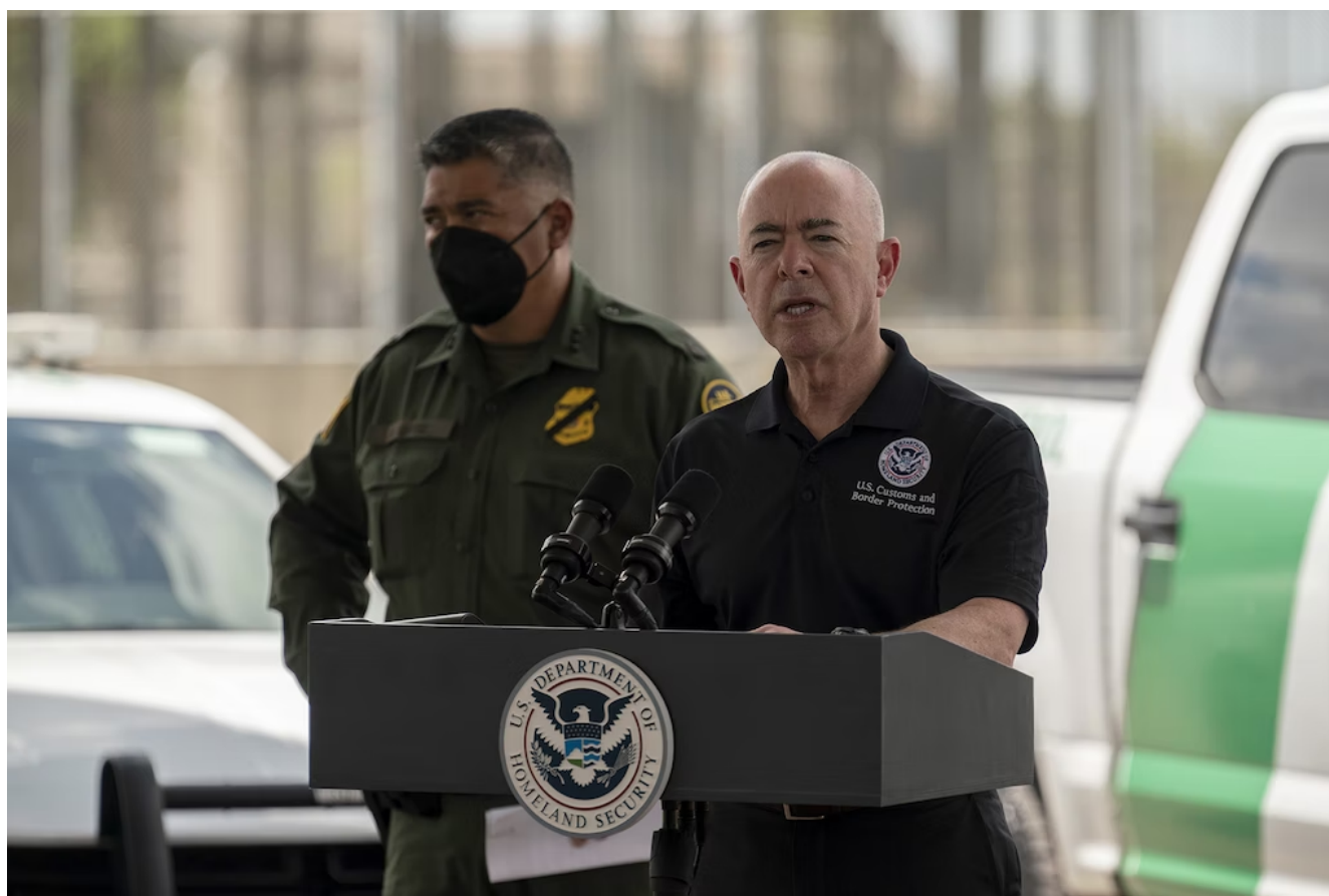
Alejandro Mayorkas, secretary of the Department of Homeland Security, speaks during a new conference in Brownsville, Texas, on Aug. 12, 2021.