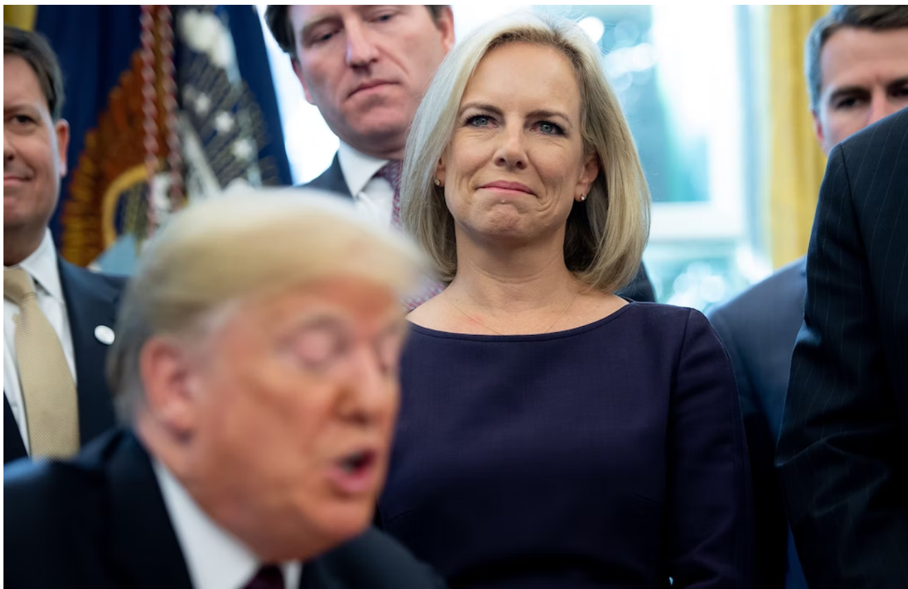
Homeland Security Secretary Kirstjen Nielsen stands alongside President Donald Trump as he speaks prior to signing the Cybersecurity and Infrastructure Security Agency Act in the Oval Office of the White House in Washington, D.C., on Nov. 16, 2018.

The stepped up counter-disinformation effort began in 2018 following high-profile hacking incidents of U.S. firms , when Congress passed and President Donald Trump signed the Cybersecurity and Infrastructure Security Agency Act, forming a new wing of DHS devoted to protecting critical national infrastructure. An August 2022 report by the DHS Office of Inspector General sketches the rapidly accelerating move toward policing disinformation.