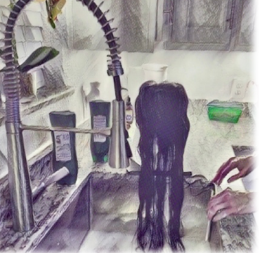
Let air dry when possible on a Wig Mannequin Head.