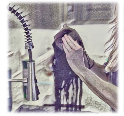
Gently massage shampoo onto the inside of the wig.