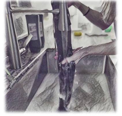
Rinse hair again the same way you rinsed out shampoo.