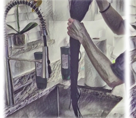
Squeeze excess water from root to tip.