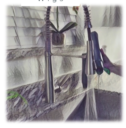
Fill sink or tub with warm water and shampoo.