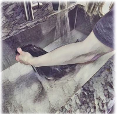
Rinse with warm water from root to tip and from inside to outside.