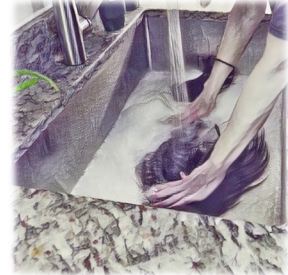
Lay the wig out flat in the water.