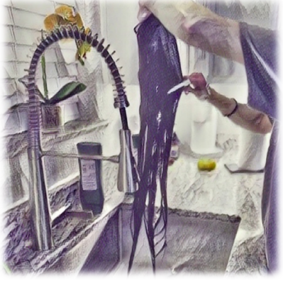
Gently comb through hair from root to tip with a large tooth comb.