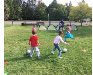
Pictured: Soccer class fun!

St. Paul's Child Care Center has weekly Music, Spanish, Chapel and Soccer. The Music Teacher, along with her guitar, has a weekly visit with each classroom. She brings different musical instruments and songs each time. The children learn rhythm, instrument names and best of all to enjoy music. Hello and goodbye songs are sung each time as a way of warming up and preparing for the end of the session. The Toddler and Preschool groups attend Soccer Classes weekly. The goal of soccer with Super Soccer Stars is to teach soccer skills in a fun, non-competitive, educational environment. The philosophy is to use soccer to nurture, to build self-confidence, and to develop teamwork in every class. Each child improves at his or her own rate while having endless fun. In Spanish both the Toddler and Preschool groups enjoy songs, movement and rhyming games to promote Spanish language skills. They start out each class with a song to get their bodies and minds ready for some learning fun. During Chapel the children spend time with our Pastor singing songs, listening to and telling stories and getting acquainted with our Church.