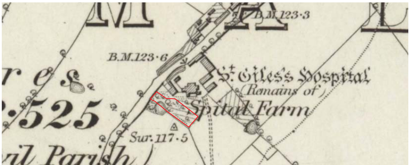
Essex LIV, Ordnance Survey Six-inch England and Wales, 1874 shows gardens within site boundary