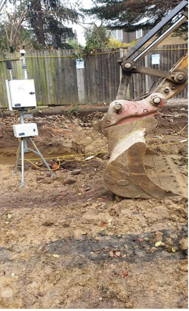
Machinery close to noise monitors