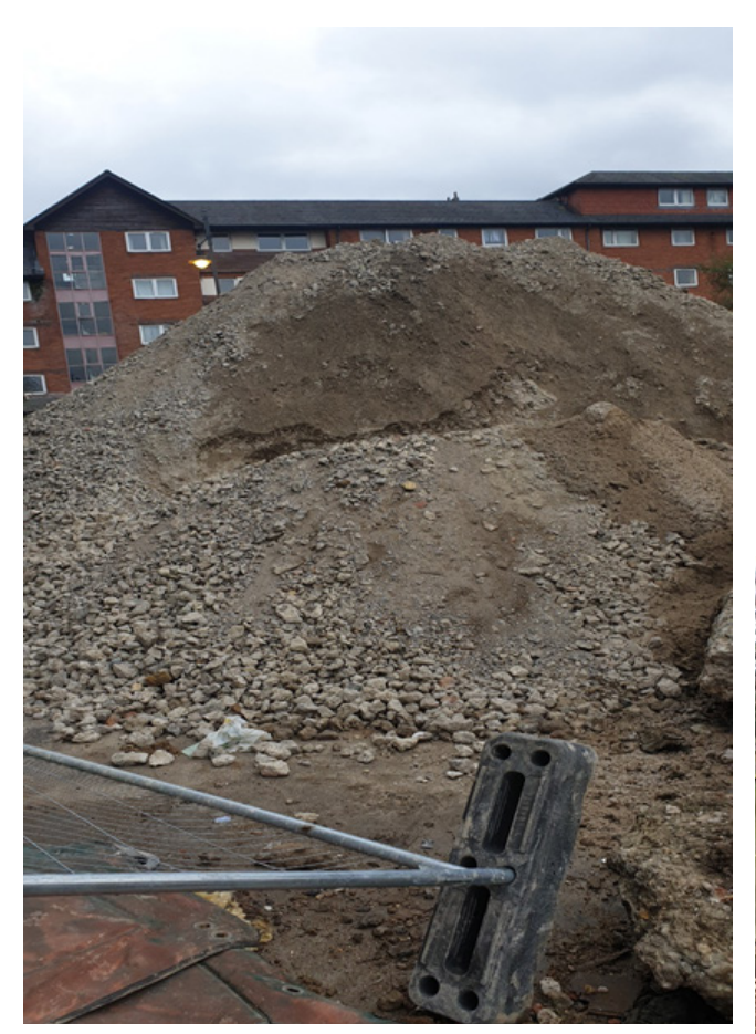
Demolition waste recycled for piling mat