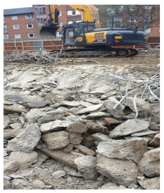
Breaking Out Ground Floor Slab