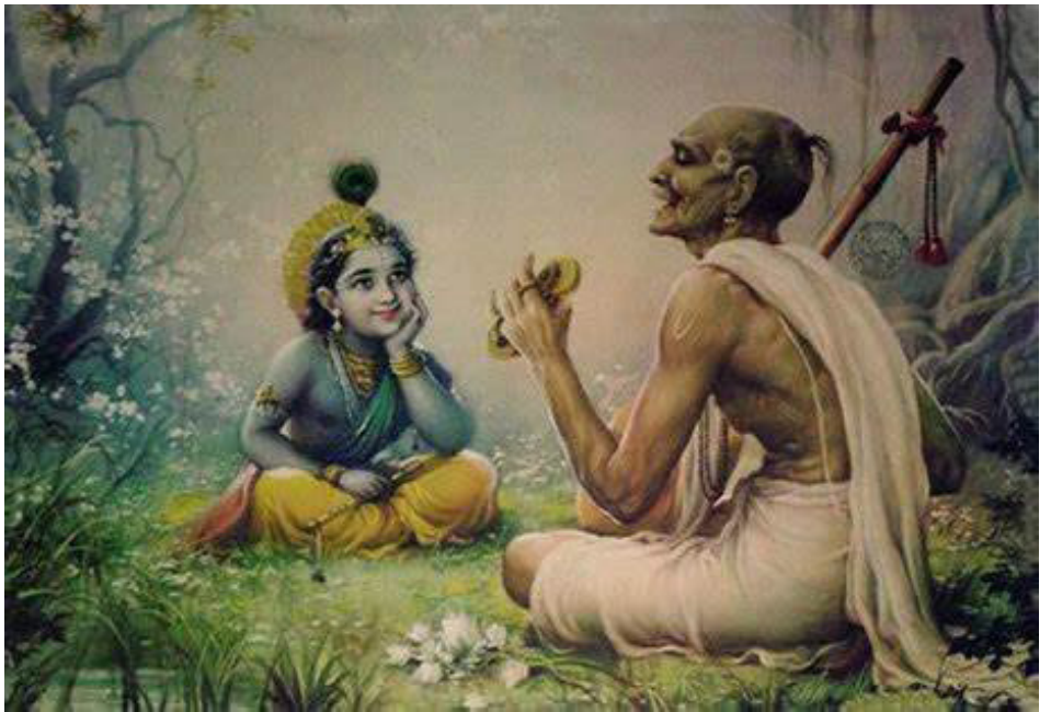
Lord Krishna listening to the bhajan of Shri Surdas.

said, why we're being told something, and what we might do about taking that communication to heart?