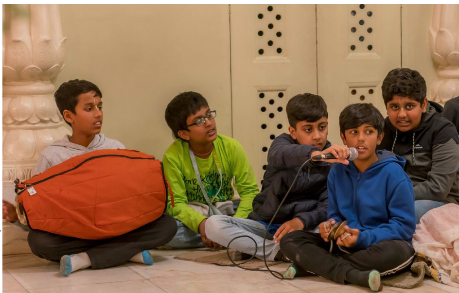
Some of the children doing kirtana in Melbourne temple.