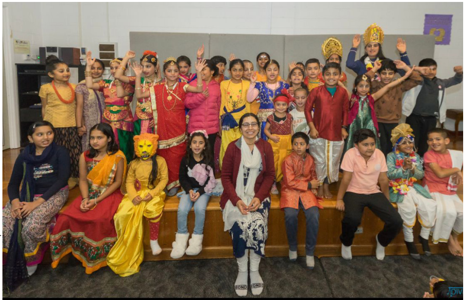
The children and youth of Melbourne temple are important members of the community.

the community of children. To cater to these ever-growing children’s spiritual needs, and to give them a devotional atmosphere and like-minded association, we have a variety of classes and activities happening not only at the temple, but in homes, online on Zoom, outdoors and at our farm. Some of the programs we have are: