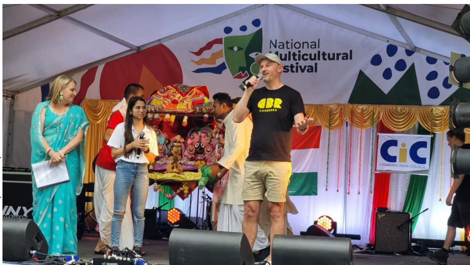
Devotee representation at Canberra's National Multicultural Festival.