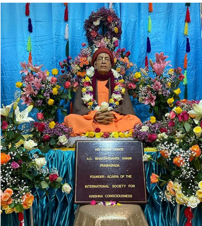
Srila Prabhupada murti in Perth temple.

Through all these different services and events, the Vaishnavis of Perth continue to nurture and deepen their relationships together more and more, reflecting inwardly and outwardly a sense of joy and love from serving Krishna and His devotees, and thus perpetuating this beautiful culture of bhakti. 🙏