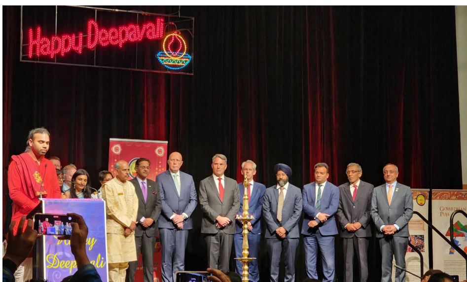
Dignitaries come together to celebrate Diwali.