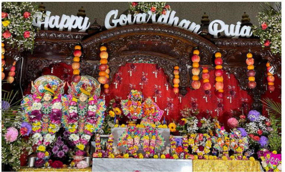
One of the many festivals celebrated in ISKCON temples.

Sunday school had growing attendances due to the talented and generous