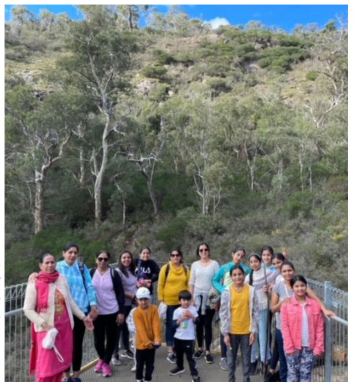
One of the outdoor catch-ups the Perth Vaishnavis organised.