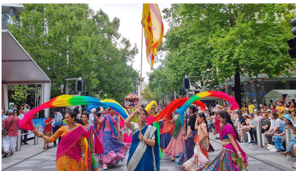
Canberra is treated to the colourful sight of hari-nama.

They strive to balance their family duties with services at the temple, and set an example to one and all. 🙏