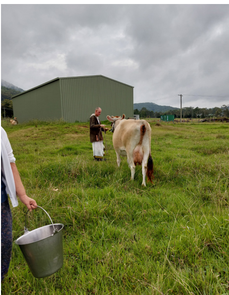
One of the farm's much-loved cows gets some special attention.

Up to a thousand guests visit New Gokula regularly on weekends eager to take darshana of the beautiful Deities and Their surrounds. The Deities, feeding the cows and taking videos of the dancing peacocks keep our guests coming back again and again and telling their friends about us.