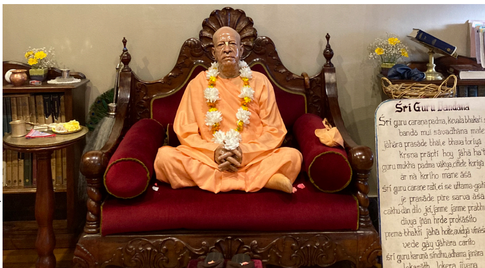
Srila Prabhupada murti on his grand vyasasana in Adelaide temple.

Garland services: Many Vaishnavis are involved in the making of the garlands for Shri Shri Radha Shyamsundara and Gaura Nitai and Srila Prabhupada murtis . This is being handled so nicely with many being trained to perform this beautiful service.