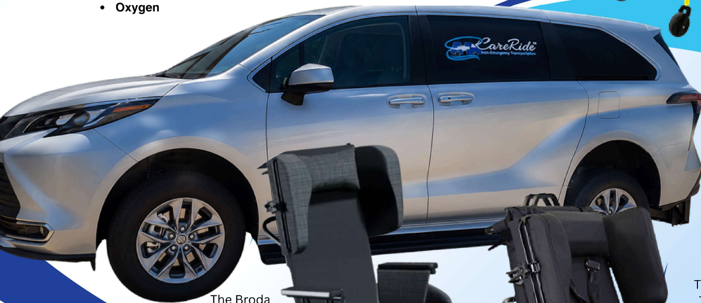
The Broda Synthesis