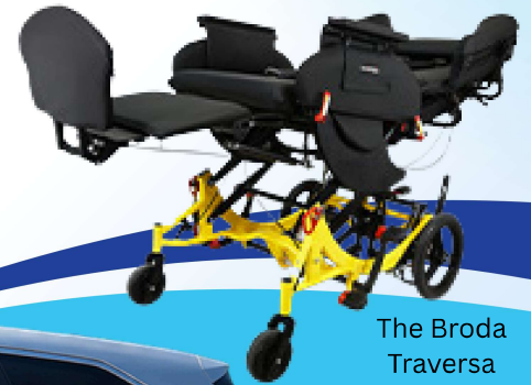
The Broda Traversa