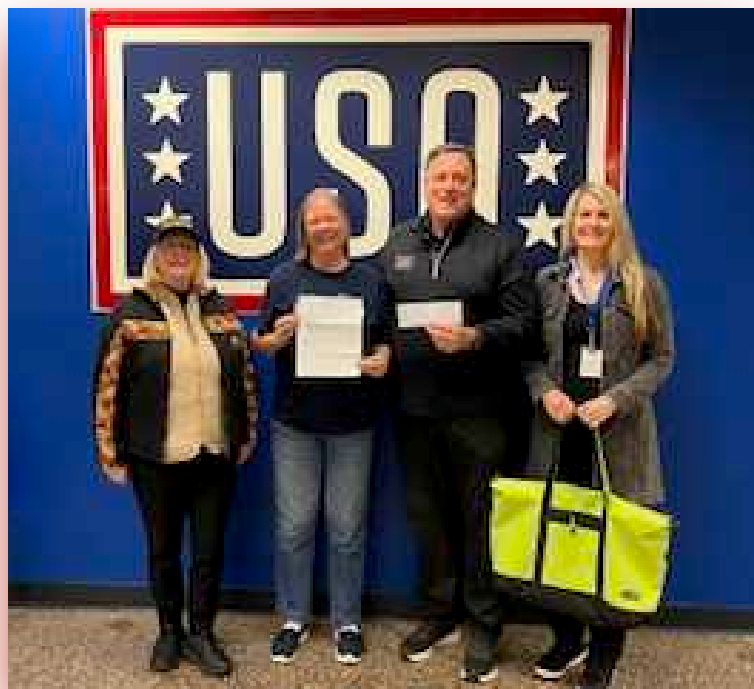
Getting our donations to the USO Northwest at Sea-Tac International Airport!