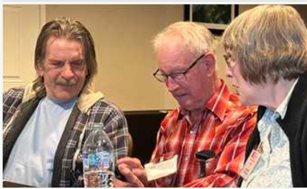
Members enjoying the Geography Icebreaker Friday night! Winners of the "geography bingo" games received simple cash prizes.