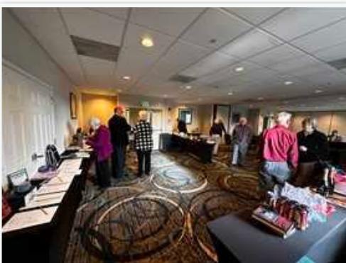
Members checking out the Silent Auction items at Saturday night's buffet dinner!

Service branch updates highlighted ongoing global operations, readiness initiatives, and personnel and equipment developments across the Army, Navy, and Air Force. Discussion included modernization efforts, reserve force structure concerns, and continued emphasis on training, wellness, and recruitment of younger service members.