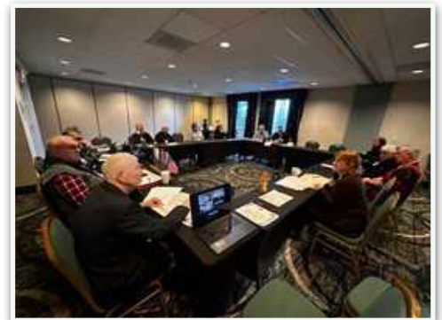
Members sharing reports

Family Readiness & Awards: Children's Writing Contest underway; increased ROTC/JROTC award activity reported.