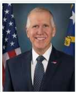
Sen. Thom Tillis (R-NC)

Accordingly, this year's October Annual Meeting will be conducted by Zoom , solely to address the business required under our governing documents. The virtual meeting will take place Saturday, October 17, 2026. Although the bylaws were amended to change the composition of the Board of Directors, our revised Charter has not yet been approved by Congress, so we must continue to operate under the current Charter provisions.