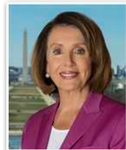
Rep. Nancy Pelosi (D-CA-11)

This year's Minute Man Hall of Fame Award recipients are Senator Thom Tillis (R-NC) and Representative Speaker Emerita Nancy Pelosi (D-CA-11) . Because Congress will not be in session during the planned October meeting, and both honorees are retiring, the awards will instead be presented in June 2026. Senator Tillis will receive his award in his office, while Speaker Emerita Pelosi will be honored at a reception at the ROA Building on Thursday, June 25, at 5:00 p.m. The Board of Directors meeting will begin the following day.