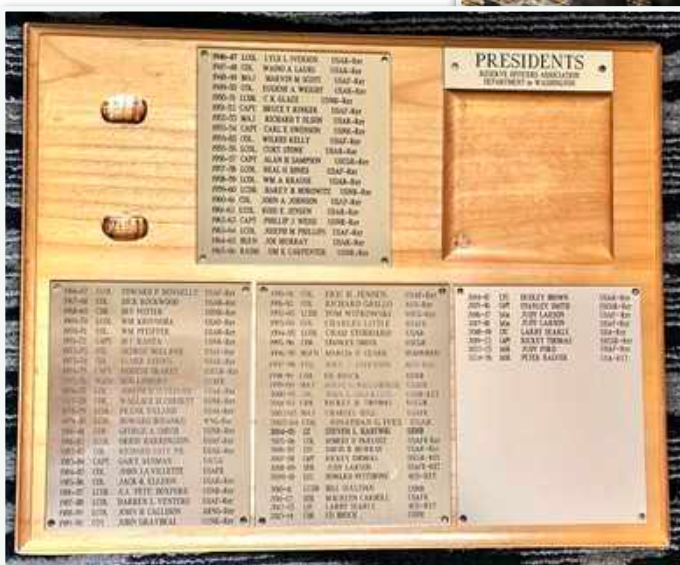
Above: Plaque showing the succession of presidents for the Department of Northwest since 1946!