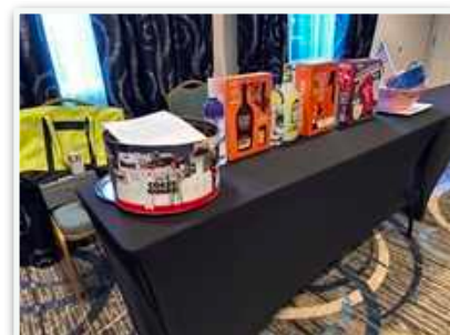
Silent auction items waiting for a bid!