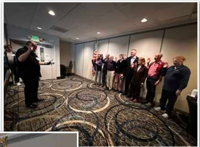
Above: New Department officers taking their Oath of Office.