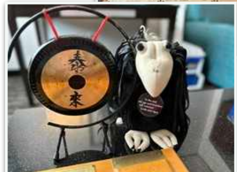
The tag reads "In the end old age and treachery will outsmart youth and vigor!"