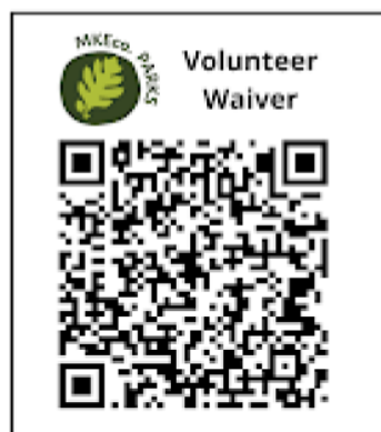
Volunteer Waiver.png 31K

Every Volunteer needs to complete the Milwaukee County Parks Waiver Form. This Waiver is good for one year from the time of completion.