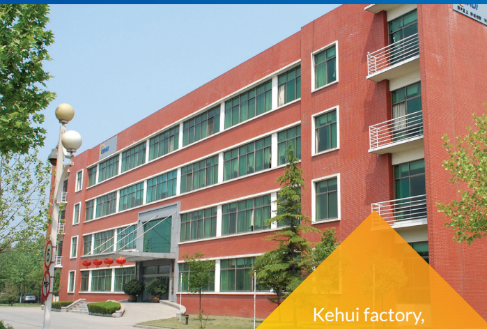
Kehui factory, Zibo, China

The company was founded in 1991 as a joint venture with a major US organisation, before becoming independent in 2005. It has utilised the best of Asian, European and American expertise to develop a selection of cable and transmission line fault locators, as well as equipment for the automation of electrical distribution systems and its range of switched reluctance motors.