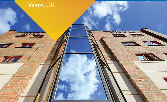
Kehui International, Ware, UK

In the Chinese language, Kehui literally means the Application of Technology. This phrase perfectly defines the company's commitment to technological innovation, which it accomplishes whilst achieving the highest levels of quality.