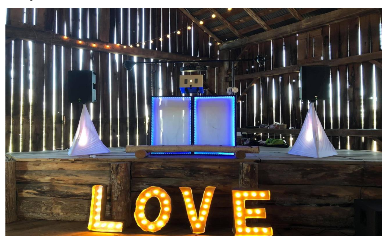
The Ultimate Party Experience (Small Speakers with Skirt Not included)