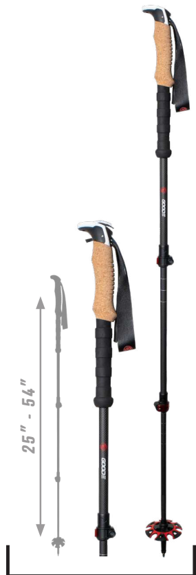
CARBON PEAK TREKKING