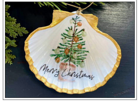
X-MAS NATURAL "MERRY CHRISTMAS" TREE IN A RUSTIC BAG-LIKE POT WITH BRONZE & CREAM ORNAMENTS