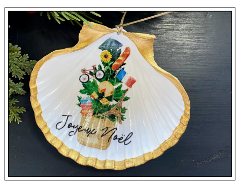
X-MAS FRENCH "JOYEUX NOËL" TREE IN A BASKET WITH MACARONS, BICYCLE, SUNFLOWER, BARET, BAGUETTE, FLAG, BRIE, & EIFFEL TOWER