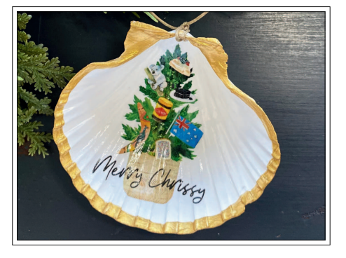
X-MAS AUSSIE "MERRY CHRISSY" TREE IN A BASKET WITH FAIRY BREAD, BOOMERANG, VEGEMITE, KOALA, PAVLOVA, LAMINGTON, & FLAG