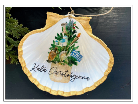
X-MAS GREEK "KALÁ CHRISTOÚGENNA" TREE IN A BASKET WITH ANCIENT VASE, SANTORINI, IONIC COLUMN, OLIVES, TORCH, FLAG & ATHENIAN HELMET