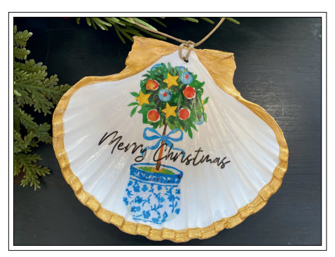
X-MAS TOPIARY "MERRY CHRISTMAS" TOPIARY IN A BLUE & WHITE POT WITH RIBBON, STARS & ROUND ORNAMENTS