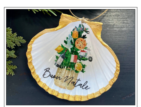
X-MAS ITALIAN "BUON NATALE" TREE IN A BASKET WITH WINE, PASTA, STATUE, OLIVE OIL, OLIVES, PIZZA, VESPA, FLAG & LEMON