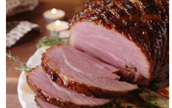
BAKED HAM FOR FAMILY OF 4-6

CHOICE OF 4 SIDES APPLESAUCE DINNER ROLLS CORN BREAD