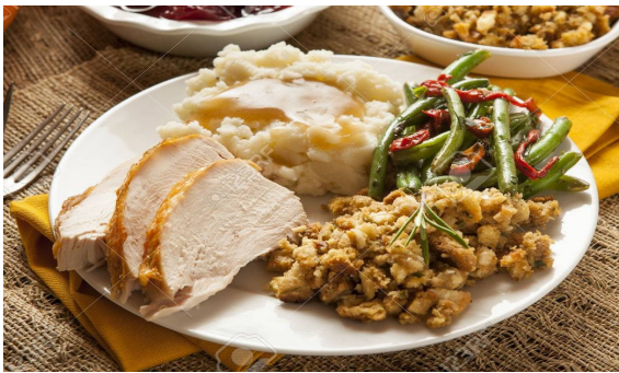
TURKEY AND GRAVY FOR FAMILY OF 4-6

PRE-ORDER DEADLINE WEDNESDAY NOV. 25TH SCHEDULE FOR PICKUP ON THANKSGIVING DAY HOT AND READY TO EAT