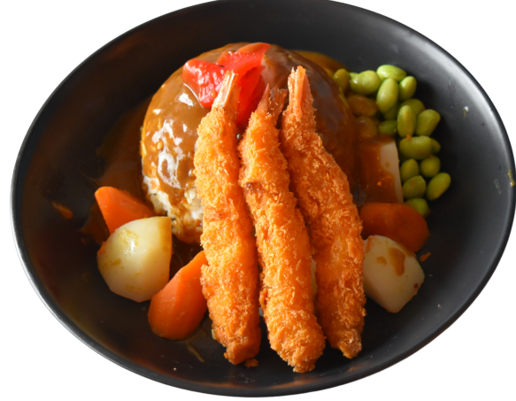
Prawn Katsu Curry

King prawns in light tempura batter served with dashi broth