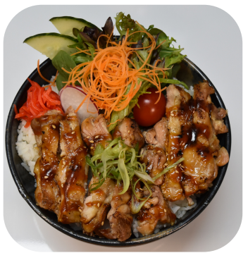
Teriyaki chicken don

Pan-fried sliced pork with sweet sesame soy, served with sautéed capsicum, cabbage & onion on a bed of steam rice topped with spring onion, red pickled ginger & dried seaweed.