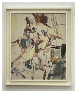
Mercedes Matter Seated Male Nude, ca 1965 oil on canvas 24' in x 20" in