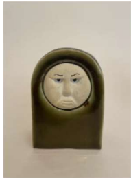
Saki Sato "T" as a Clock, 2022 porcelain 4" x 3" x 2"