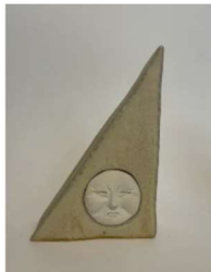
Saki Sato "T" as a Triangle, 2022 Porcelain 6" x 4" x 1.5"