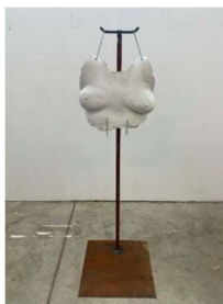
Lia Vale Kucera Concrete Mom, 2022 plaster, concrete, metal 59" x 18.25" x 20"