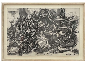
Mercedes Matter Untitled, 1978 charcoal on canvas board 35" x 25.5"