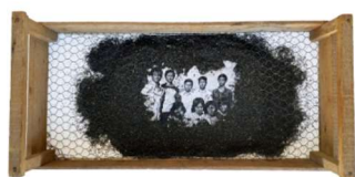
Dana Nguyễn Untitled, 2022 sifter, black sand, inkjet print 12.5" x 26.25" x 6.5"