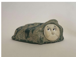
Saki Sato "T" as a Rock, 2022 Porcelain 3" x 7" x 3"