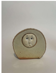
Saki Sato "T" as a Biscuit, 2022 4.5" x 4.5" x 1"