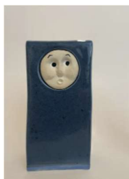
Saki Sato "T" as a Slab, 2022 porcelain 6" x 3" x 2"