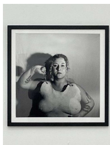
Lia Vale Kucera For Now, 2022 gelatin silver print 20" x 20"