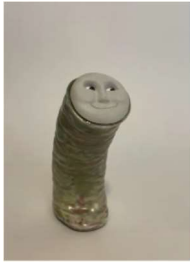
Saki Sato "T" as Worm, 2022 porcelain 6" x 3" x 2"