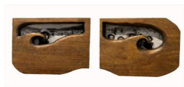
Dana Nguyễn The Pacific Swallowed Us Whole, 2022 hand carved wood frame and inkjet prints right side; 6" x 7" left side: 6" x 7"