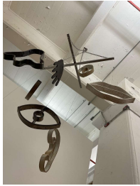
Carmen Amengual Una fuerza que venga y me una, 2022 (May a force come and bring me together) clay, wire rope, steel 96" x 42" diameter