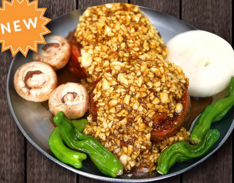
Garlic Finger Ribs 마늘 갈비 56.50