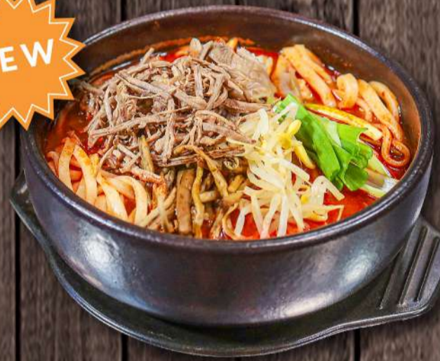
Yuk Gae Jang (Spicy Beef) Noodle 육개장 칼국수 17.50