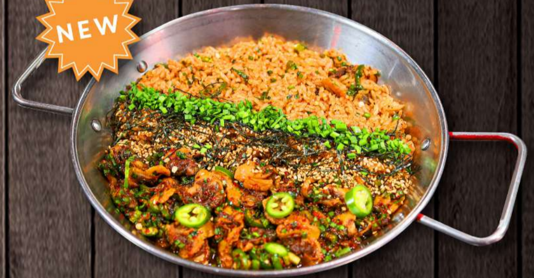
Cockle (Clam) Bi Bim Bap 꼬막 비빔밥 17.50