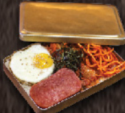
Hobak Rice Box* 옛날 도시락 14.50