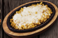
Corn Cheese 콘치즈 8.50