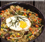
Angus Fried Rice* 앵거스 볶음밥 16.50