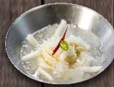
Dongchimi Noodle 동치미 국수 13.50