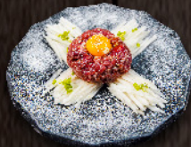
Angus Beef Honey Tartare* 앵거스 꿀즙육회 31.50