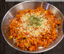
Cheese Kimchi Fried Rice* 치즈 김치 볶음밥 16.50