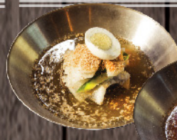
Buckwheat Noodle 롤냉면 16.50