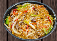
Jap-Chae 잡채 17.50