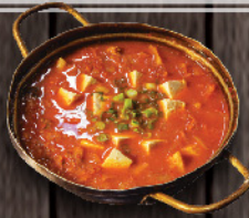
Kimchi Stew 김치찌개 16.50