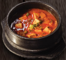
Red Chili Paste Stew 고추장찌개 16.50