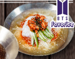
Hobak Special Noodle 호박 물국수 16.50