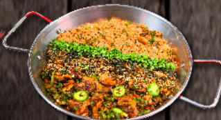
Cockle (Clam) Bi Bim Bap 꼬막 비빔밥 16.50