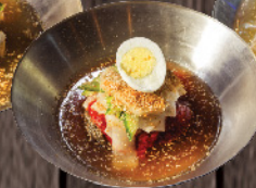
Spicy Buckwheat Noodle 비빔냉면 16.50