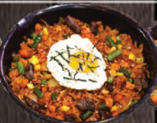
Spicy Angus Fried Rice* 앵거스 매운 볶음밥 17.50