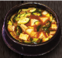
Bean Paste Stew 자른 된장찌개 16.50