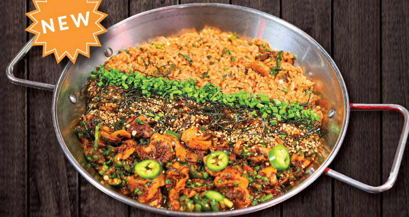
Cockle (Clam) Bi Bim Bap 🌶️ 꼬막 비빔밥 17.50