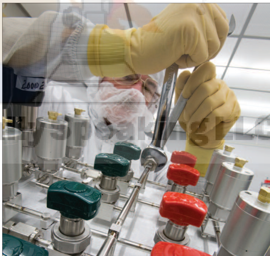
Air Products worker assembles a gas cabinet in a cleanroom environment at the company's Semiconductor Equipment Manufacturing Center located in Allentown, Pennsylvania.