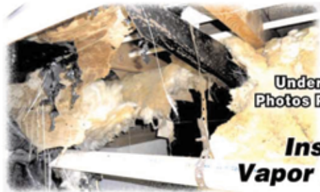
Underhome Photos Provided

Insulation Under Your Home Falling Down? Holes and Tears in Your Vapor /Moisture Barrier?