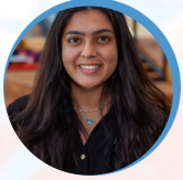
Inayat Kang Girls in Tech Programs