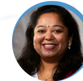
Swarna Sethu Community Outreach