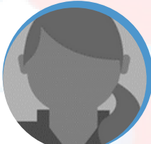
TBD Technology Lead