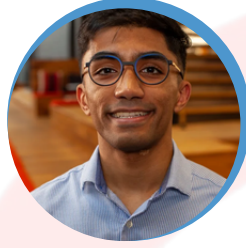
Sishir Dодdл Analytics & Reporting