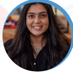
Inayat Kang Girls in Tech Programs