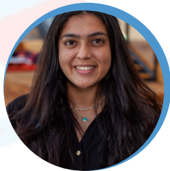
Inayat Kang Girls in Tech Programs