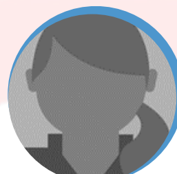
TBD Expansion Lead