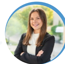
Piper Duke Girls in Tech Programs