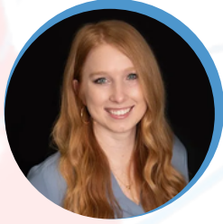
Marin Scott Events & Logistics