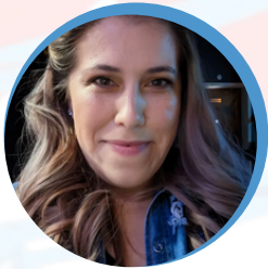
Evelyn Williams Community Outreach