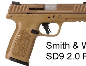
Smith & Wesson SD9 2.0 FDE 9MM