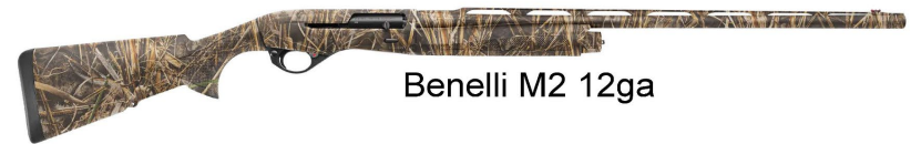
Benelli M2 12ga