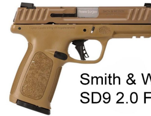
Smith & Wesson SD9 2.0 FDE 9MM