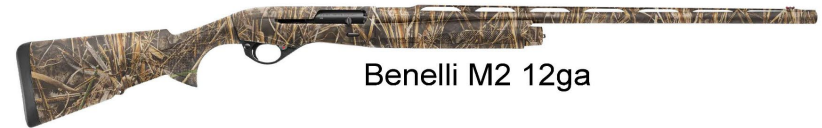
Benelli M2 12ga