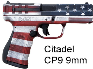
Citadel CP9 9mm