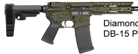
Diamondback DB-15 Pistol 5.56