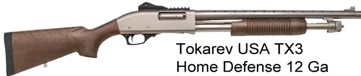
Tokarev USA TX3 Home Defense 12 Ga