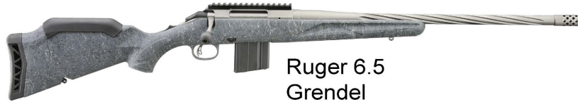
Ruger 6.5 Grendel