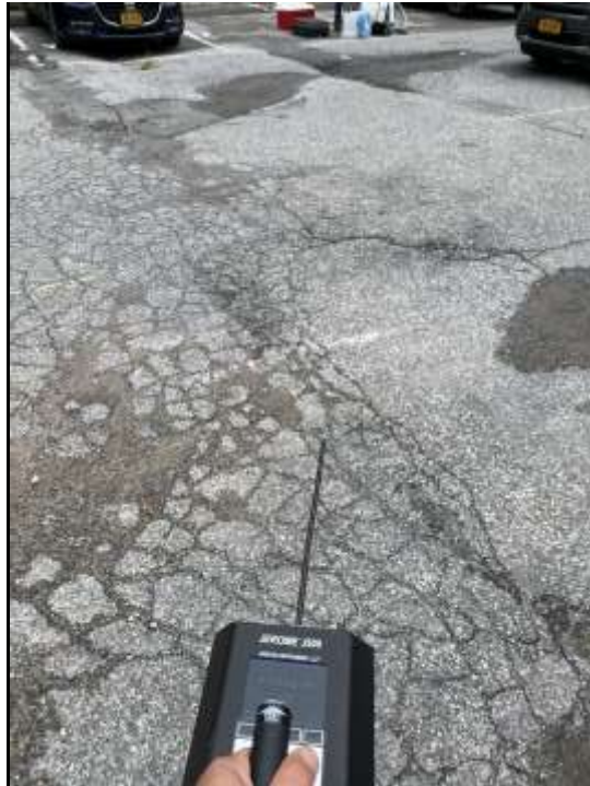
Photo 1: View of downwind ambient air monitoring while groundwater sampling