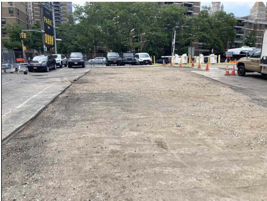
Photo 2: View of parking lot surface repair and CAMP station PM-4 and PM-5 (facing project north).