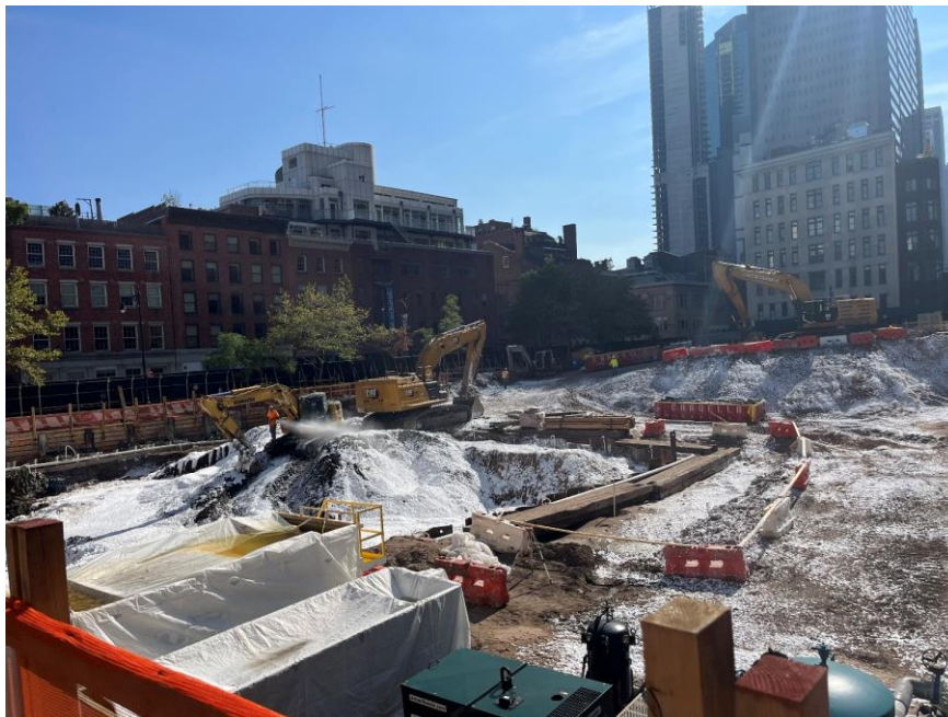
Photo 2: CCJV applying Atmos® AC-645 dust/vapor suppressing foam to exposed soil/fill for the temporary overnight cover (facing southwest)