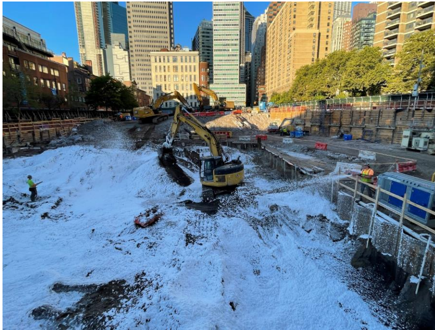
Photo 1: CCJV actively applying Atmos® AC-645 dust/vapor suppressing foam during excavation/loading in the southeastern part of the site (facing west)